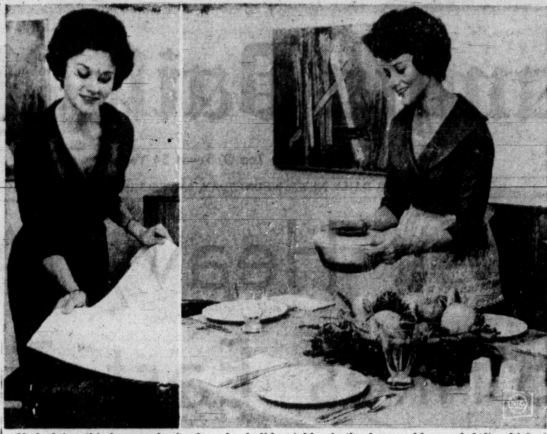
Underlying this homemaker's plans for holiday tables is the foam rubber pad, left, which protects table against heat and spills. At right, pad is covered with a beige Belgian linen cloth embroidered with wheat sheaves.

NEW LOCATION—CROSSMAN APPLIANCE CO. 523 W. FOSTER