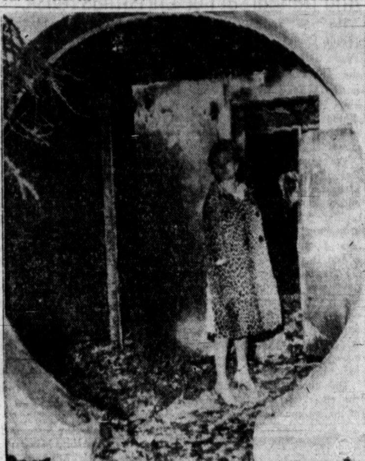
HOME DESTROYED — Actress Zsa Zsa Gabor is framed in the circular doorway of her $275,000 Beverly Hills, Calif., home that was destroyed by the worst fire in the history of Los Angeles. Miss Gabor was in New York at the time of the fire and flew home this week to inspect the ruins.