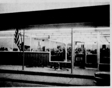
CASHWAY'S NEW LOOK -- Cashway here in Muleshoe has a n look as they have undergone a face-lifting which adds to the attractiveness of the building.

October 29 and 30,1965 at a preplant. One hundred twentyseeding rate of 100 pounds per applied at planting time to all acre on land from which grain plots, Anhydrous ammenia was sorphum had been harvested applied to 50 pounds per acre about 45 days prior to the seedduring irrigation as a toptress ing of wheat, Staty-six pounds application on April 19,1966, of nitrogen in the form of an-All plots were harvested on June hydrous ammenia was applied 26.