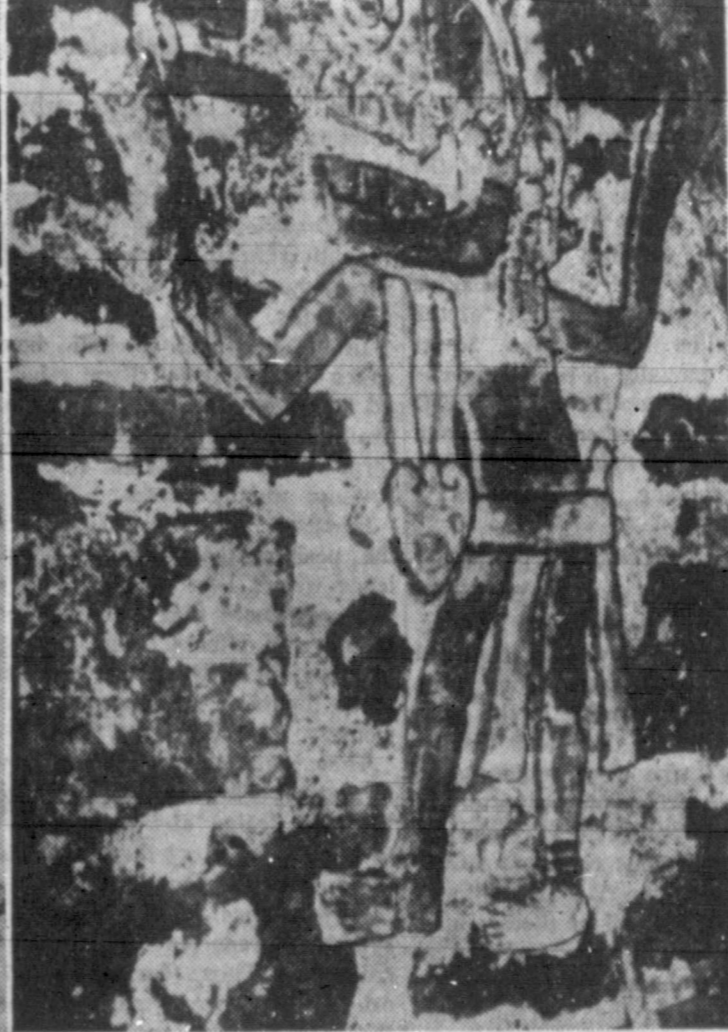
OLD STORY —Explorers in Zaachila, Oaxaca State, Mexico, have made excavations in the former capital of the ancient Zapotecan Indian empire for more information on pre-Conquest Mexican history. At left, a Zaachila church overlooks one of the excavated tombs of the old Zapotecan city which may date back to 1200 A.D. Niches in the walls were filled with human bones, indicating it may have been a mass burial ground. Stucco murals, done in many colors, are unlike any found in previous pre-Conquest ruins. At right, a stucco mural depicts an ancient Zapotecan deity.