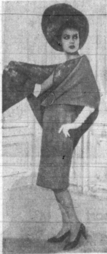
BUCKLE DOWN —Paris buckles down to an unconventional combination in a cocktail dress of pink checked wool and floral printed pink chifon for spring. A big buckle anchors one end of the chifon-lined stole to the waist for the natural look.