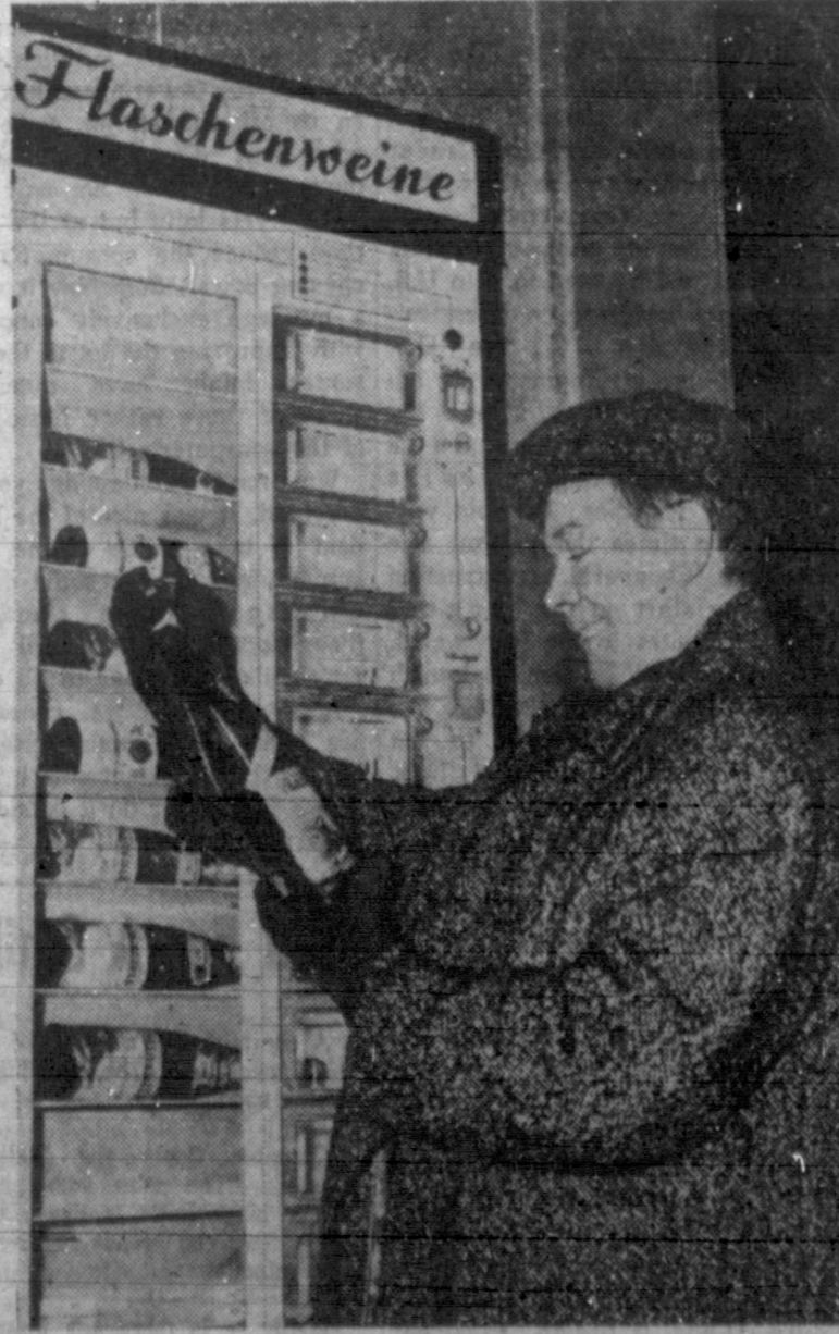
WINE SELLERS —A lover of wine admires a bottle he just received from this new "wine automat" at the wine growing village of Traiskirchen, Austria. The machines, offering wine for 80 cents a bottle, are frowned upon by innkeepers who claim juveniles can easily obtain the alcoholic beverage this way while they can't in licensed pubs.