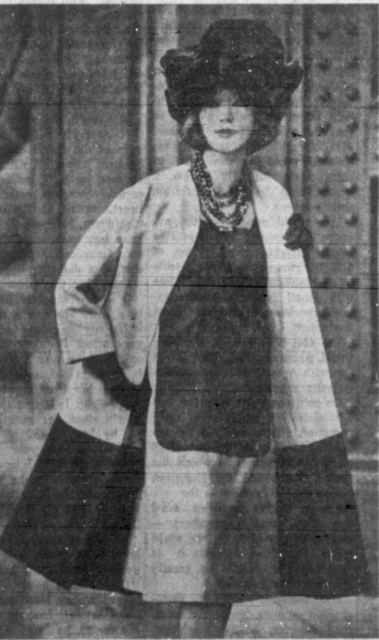
HIGH-STYLE APRON —High fashion wears an apron in the afternoon to cocktail parties. An apron-like black panel is set on the front of an unbelted dress of apricot silk shantung from Milan, Italy. The companion coat is finished with a broad hem of matching black silk shantung. Obviously, the lady is not throwing her own party.