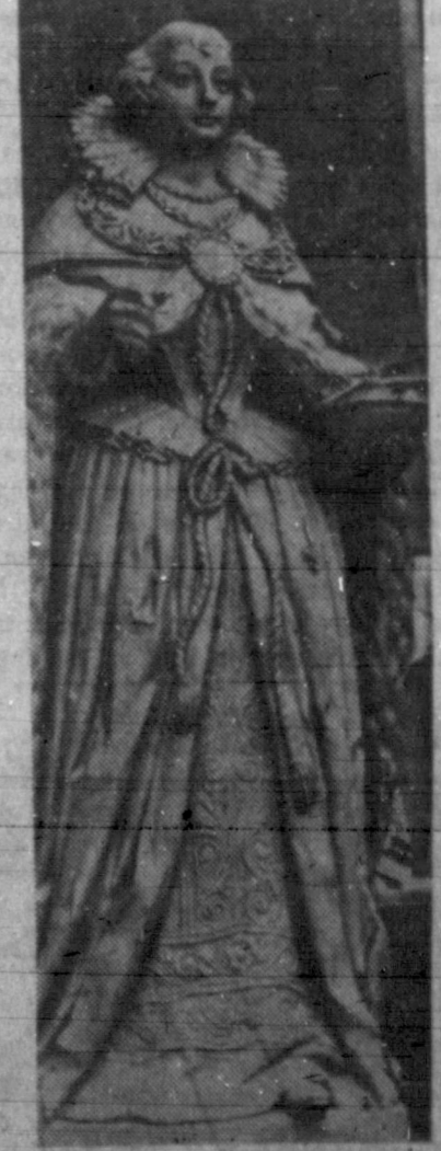
NEW WORLD BOUND —A life-sized statue of Queen Elizabeth I stands ready for her trip from London to the New World. The bronze statue will be unveiled at Jamestown, Va., to mark the 350th anniversary of America's foreign trade and commerce, which began at the English settlement of Jamestown in 1612.