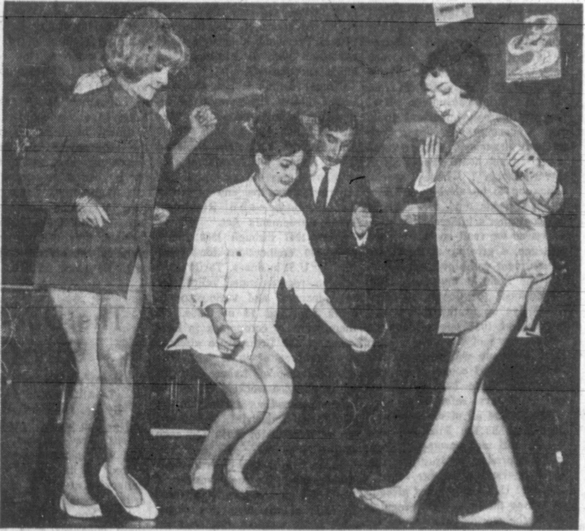
SHIRT-TWISTERS —In Paris, France, a fashion show displaying the latest in men's shirts had an original twist. Dancing girls modeled the male apparel sans trousers while doing the Twist dance. Their partners were more conventionally clothed in shirts with ties, plus suits and the all-important shoes for sliding around the floor.