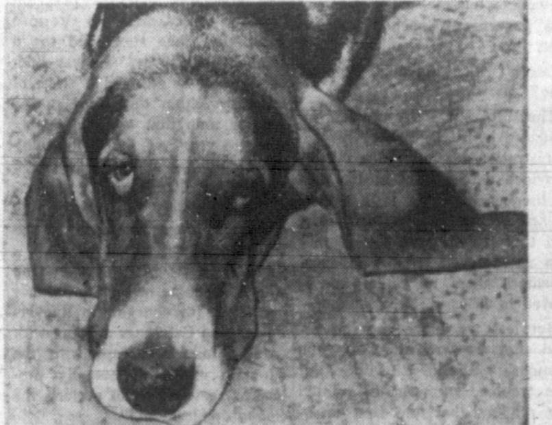
PORTRAIT OF J. WELLINGTON, ESQUIRE —"J. Wellington, Esquire," a dog of passionate interests, displays classic indifference to the camera as he has his picture taken.