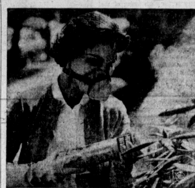
Behind that mask a homemaker sprays her garden plants, safe from dust or liquid insecticides.