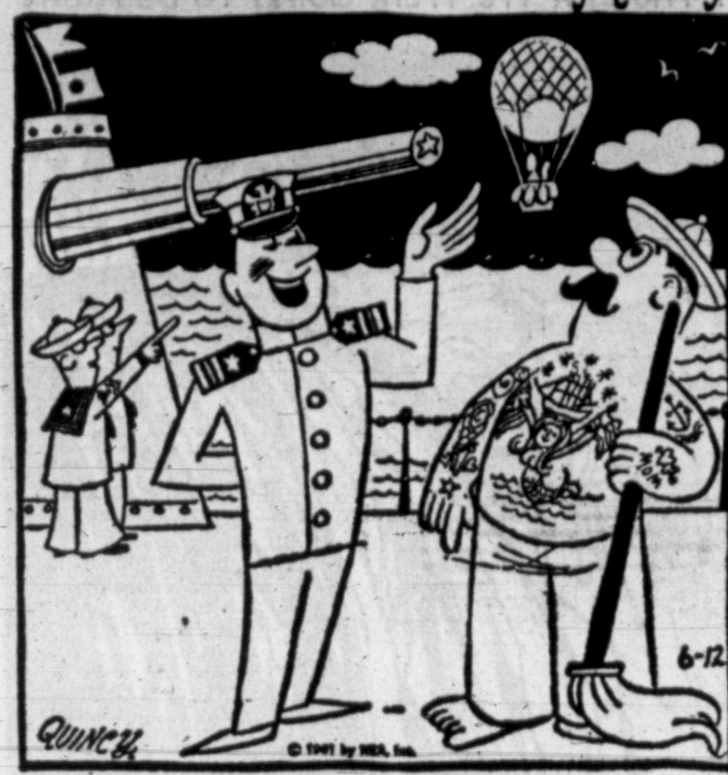
"You never find a U.S. Navy man fooling around up there in space. We'll stick to ships!"