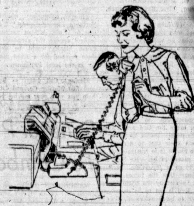
DATA-PHONE—For fast transmission of data between cities.

Mr. Goodson then gave many examples of services. Here are just a few high lights: