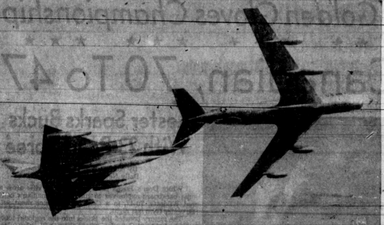
FILL 'ER UP, SIR? —A B-58 Hustler, capable of twice the speed of sound, and an Air Force KC-135 (military version of the commercial 707 jetliner) are connected by a refueling boom over Fort Worth, Tex. The Hustler, fastest U.S. bomber, is built in Fort Worth by Convair. The tanker is built for Strategic Air Command by Boeing in Seattle.