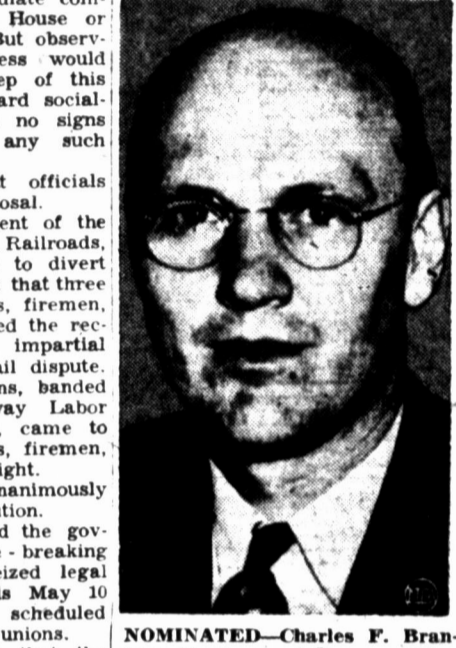
NOMINATED—Charles F. Brannan, 44, above, of Denver, Colo., assistant secretary of agriculture, has been nominated by President Truman to succeed Clinton F. Anderson as secretary of agriculture. Anderson left the cabinet to seek the Democratic U. S. senatorial nomination from New Mexico.

Bear front end alignment, complete brake service, Pampa Safety Lane, 511 S. Cuyler, Ph. 101—adv.