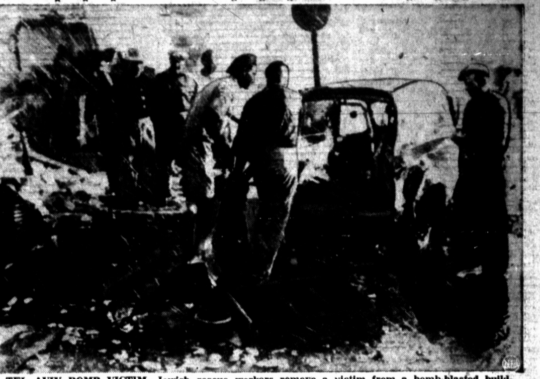
TEL AVIV BOMB VICTIM—Jewish rescue workers remove a victim from a bomb-blasted building after an Arab air raid in Tel Aviv, capital of Israel. Water from a broken main soaks the street and the workers. Arabs were attempting to disorganize Jewish defenses by heavy shelling and food and water blockade.

7. The duty and loyalty of citizens to their country and its Constitution are higher than and superior to any duty and loyalty to any party.