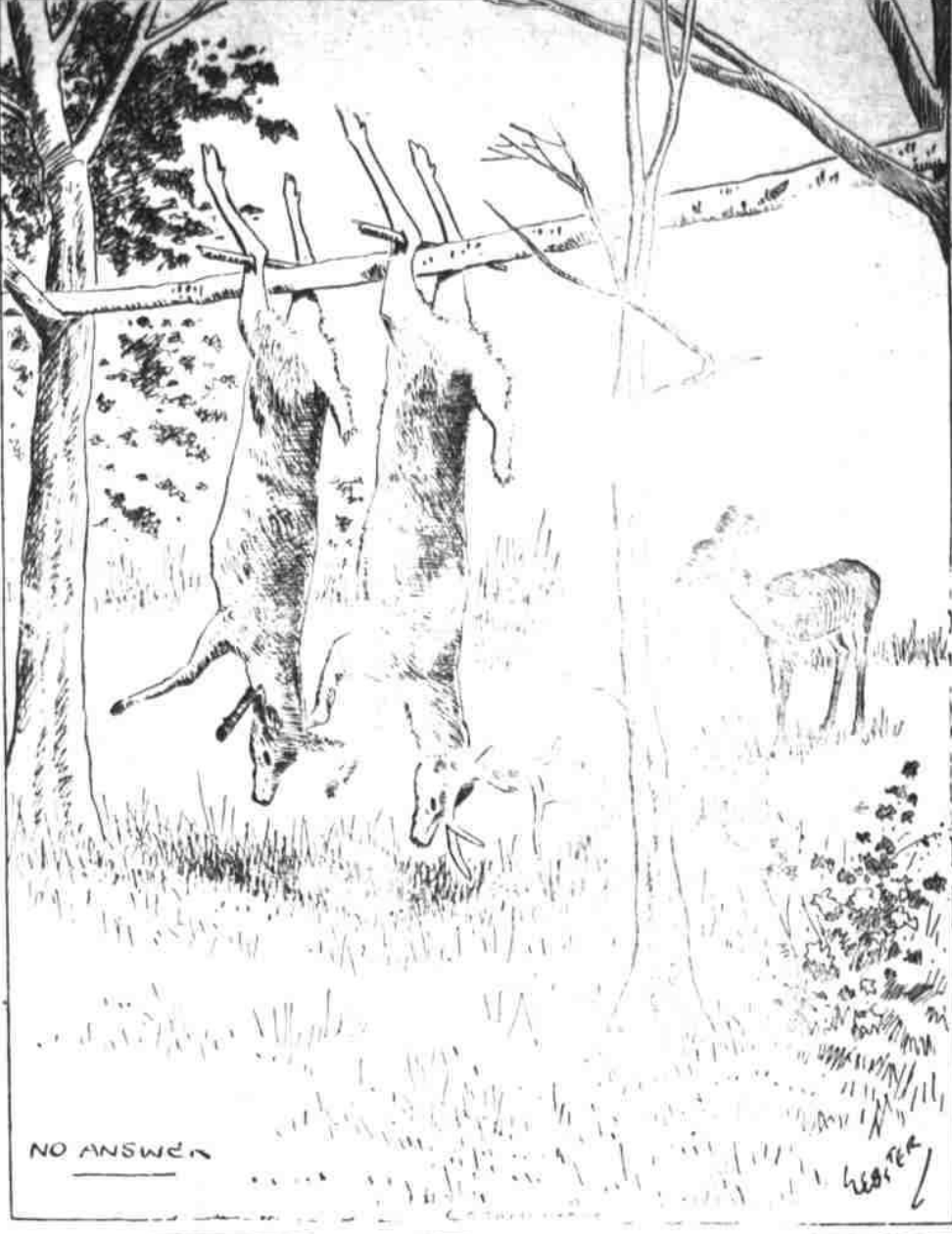
NO ANSWER by Wellington