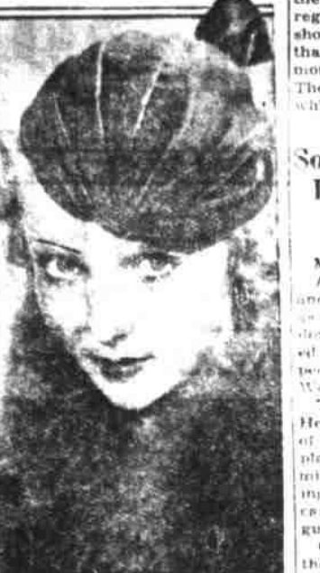
A dinner turban of cel gray velvet is worn by Ida Lupino, screen actress. This altered model has a flip of a velvet bow that stands up at the back.