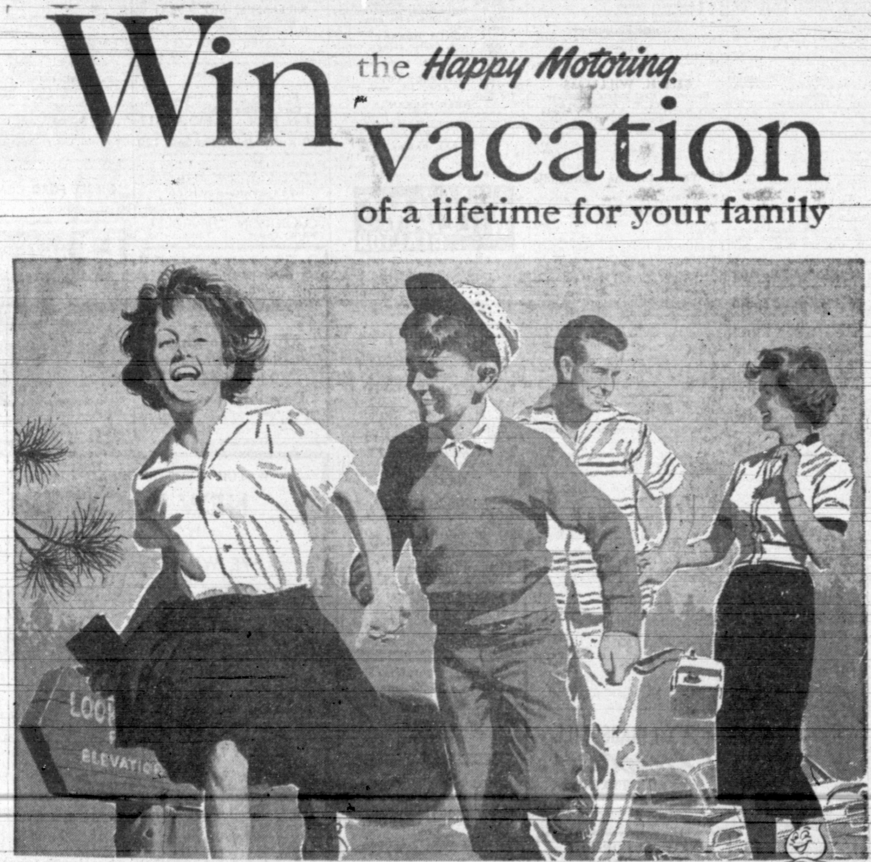
"See America first... as Humble's guest!"

register for Humble's Happy Motoring Prize-o-Rama 1000 Prizes nothing to buy!