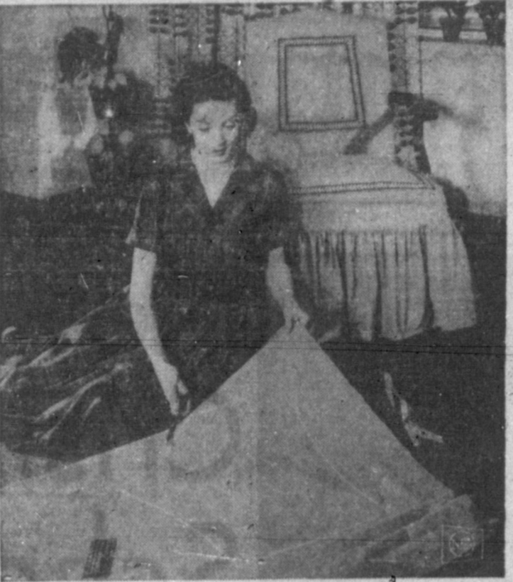
An old chair takes on new life with a new slip cover in a dacron-cotton blend. The same fabric which the girl is cutting will slip cover another chair to fit into room scheme.