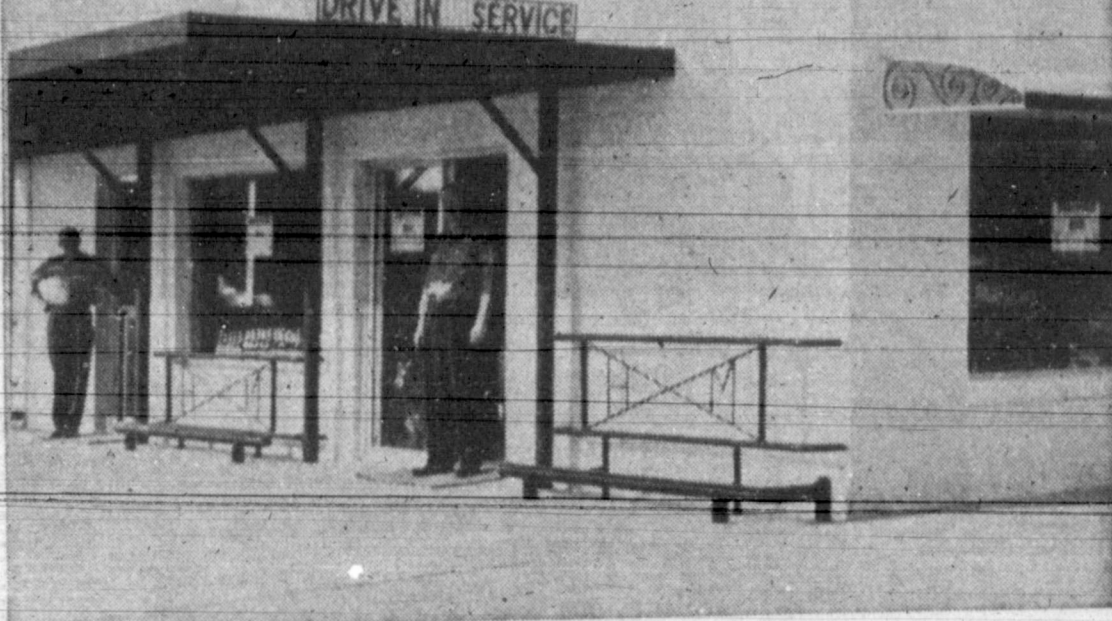
READY TO SERVE—Herb Lotz, left, and Myron Dorman at the two doors of their drive in service department. The new store, named H & M Cut Rate Liquors, is located at 866 W. Foster, and carries a complete line of quality beverages at a big savings.