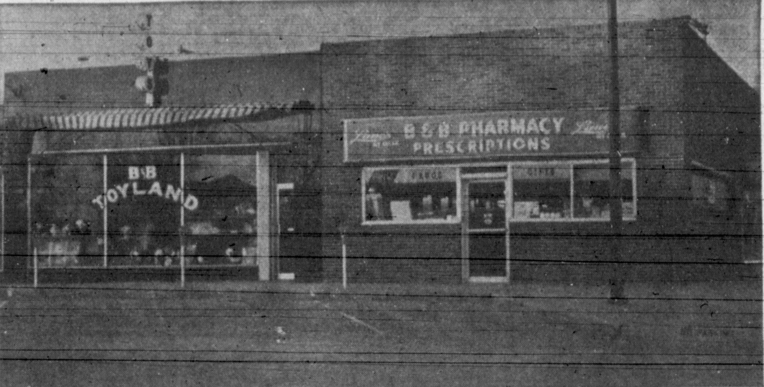
SHOPPING PLACE—B & B Pharmacy and B & B Toyland are the best places in town to do your Easter shopping. B & B Pharmacy features a complete line of cosmetics, costume jewelry and Lady Buxton items for the

The Times also reported a "whispering campaign" against Kennedy because he is a Roman Catholic. The intensely anti-Catholic Ku Klux Klan was once a strong power in West Virginia.