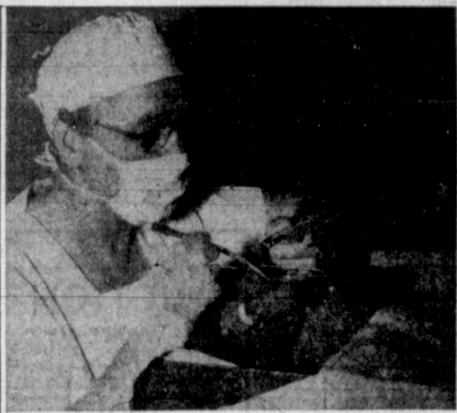
Dr. Virginia Apgar is shown here doing the "Apgar Score" on a newborn infant. It is a five-second evaluation method to determine whether the baby is a normal, healthy child or seriously ill. Dr. Apgar is chief of the division of congenital malformations (birth defects) for The National Foundation, parent organization of the New March of Dimes.

Dr. Virginia Apgar, chief of the division of congenital malformations of The National Foundation, parent organization of the New March of Dimes, began in 1952 to develop just such a method. What she invented is a mathematical approach now being used in hospitals in the United States and abroad. It is called the "Apgar Score." It can be done in five seconds or less.