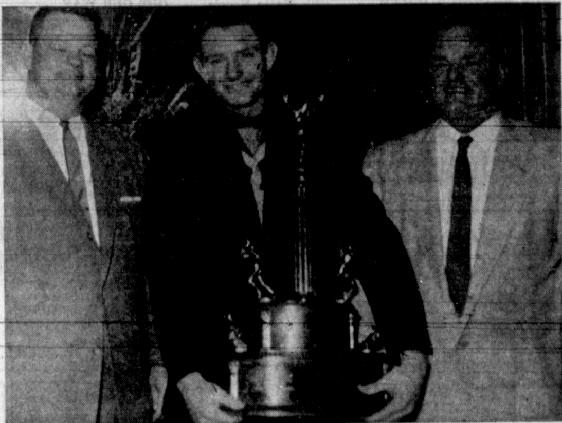
FOOTBALL BANQUET - The Canadian Rotary Club last week gave its annual football banquet honoring high school players and coaches...