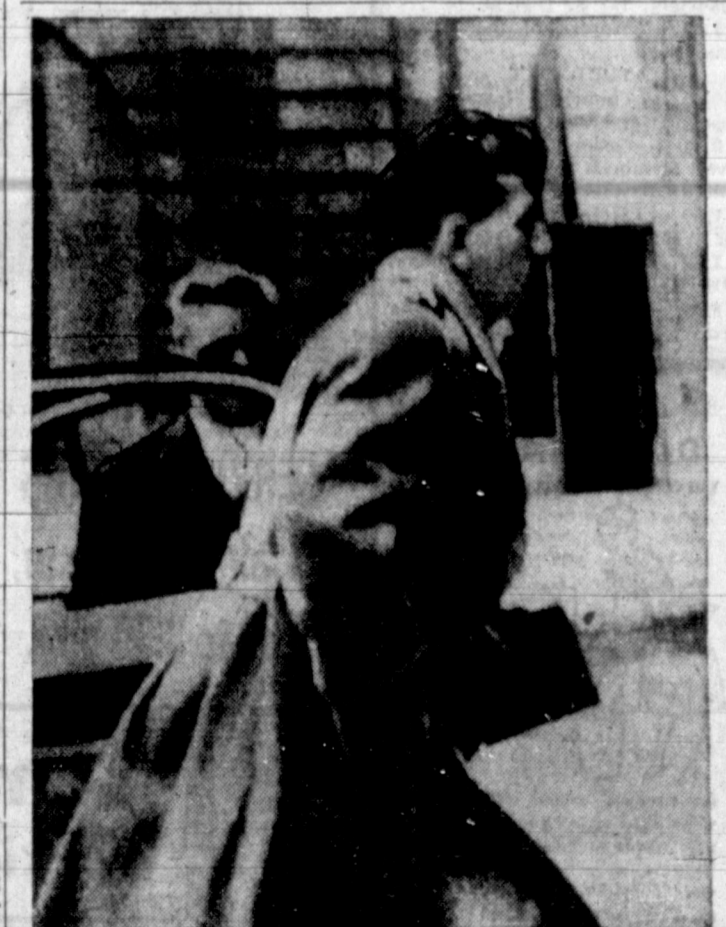
OUSTER MOVES PEOPLE — Maj. Gen. Jacques Massu is shown as he strode into the Elyseé Palace to confer with Gen. Charles de Gaulle late last week. Massu was relieved of his command in Algiers. This act precipitated a battle, begun as a demonstration by right wing groups protesting his firing.