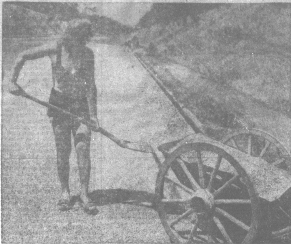
Rushing completion of vital highways in Germany, even the women join road-building gangs. During a sizzling heat wave, this woman found bathing suit and beach shoes a comfortable laboring costume.