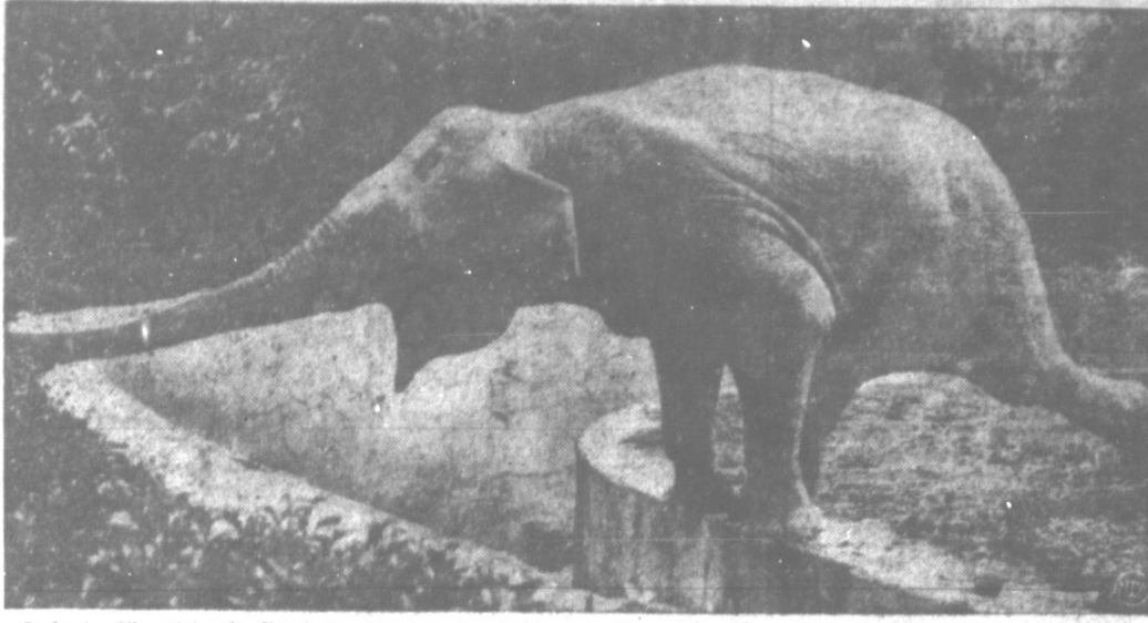
It looks like this elephant, in the Overton Park zoo, Memphis, Tenn., is trying to make like a ballet dancer. Actually, he's reaching across the eight-foot stone-lined moat for some green foliage.