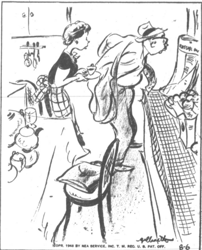
"Take another sip of this coffee before you go, dear, and the Russian situation may clear up!"