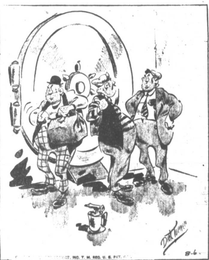
"This job may take longer than we thought, chief—'Soup' can't get the zipper on the tool bag open!"