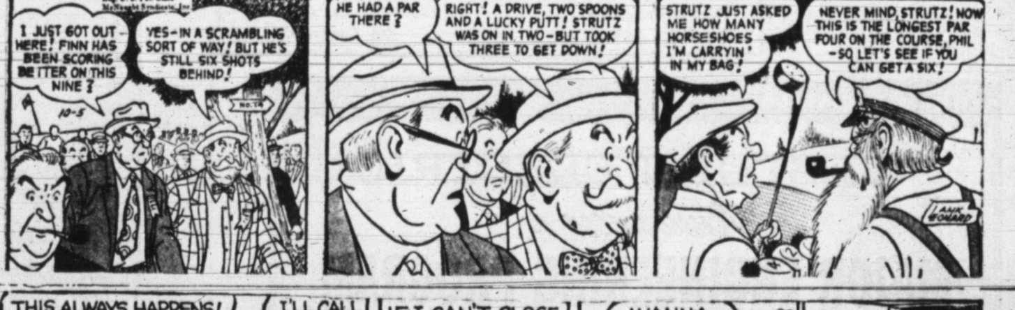
Mutt and Jeff