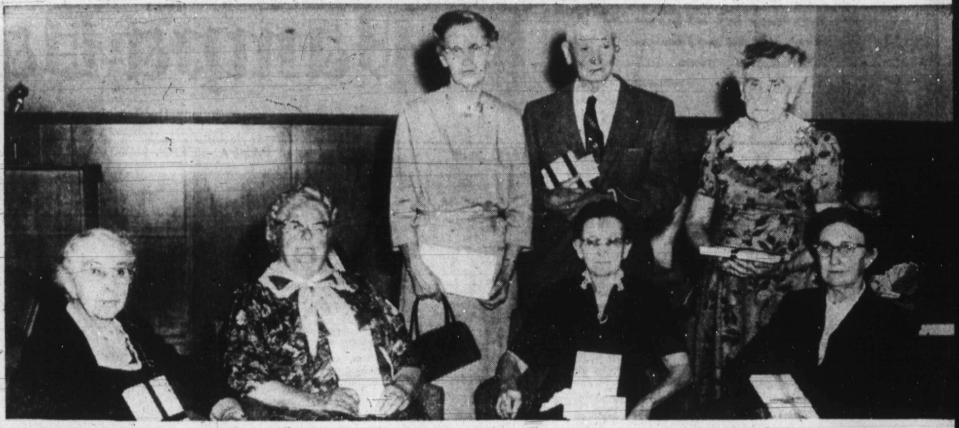
OCTOBER HONOREES — October birthdays of Senior Citizens were celebrated on Thursday afternoon in Lovett Memorial Library.

AVOCADO RING WITH LOBSTER SALAD (Yield: 6 servings) Two envelopes unflavored gelatin, 1/2 cup lime juice, 1 1/2 cups boiling water, 1 tablespoon instant bouillon mix, 2 teaspoons instant minced onion, 2 teaspoons aromatic bitters, 3 cups (2 to 3) ripe pureed avocados, 1/4 cup French dressing, salad greens for garnish.