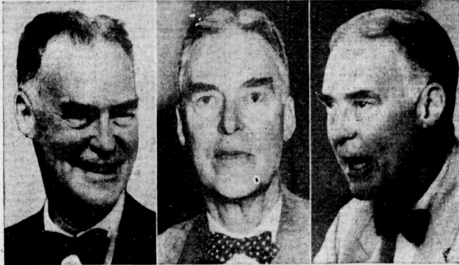
THREE FACES OF HERTER

It also was approved by the House but died in the Senate in the first called session.