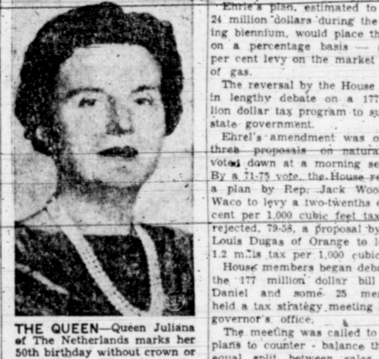
THE QUEEN — Queen Juliana of the Netherlands marks her 50th birthday without crown or robes of state. The only daughter of Queen Wilhelmina succeeded to the throne on her mother's retirement in 1948.

"AIR-CONDITION" YOUR SKIN WITH dermassage