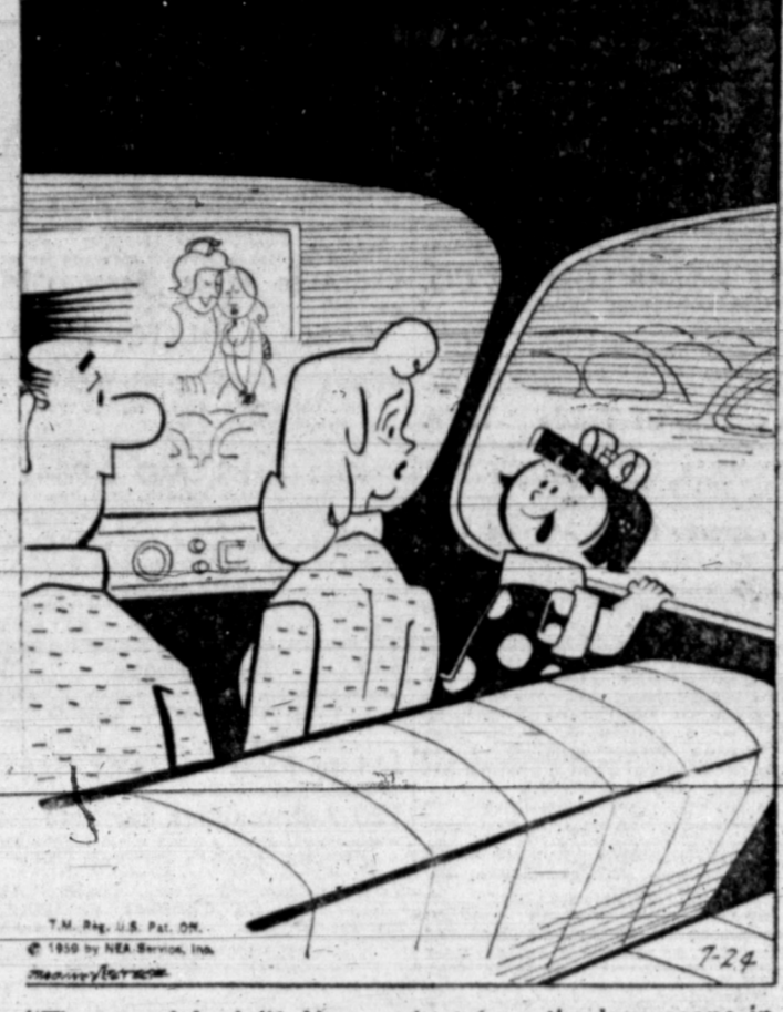
"That movie's dull! You ought to see the love scene in the car next to us!"