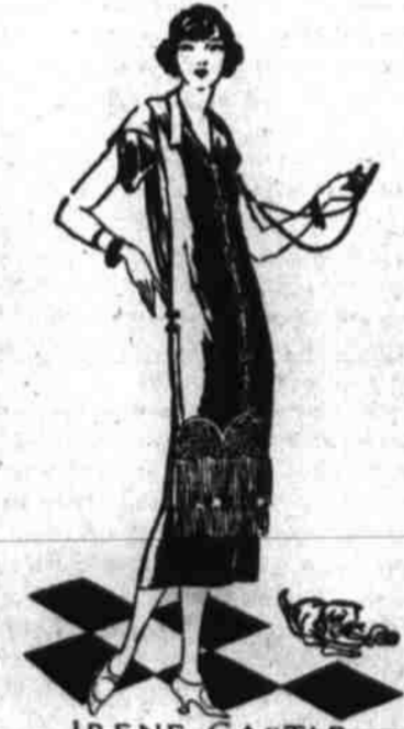
IRENE CASTLE CORTICELLI FASHIONS The ANTOINETTE Model

We invite your inspection of these exclusive new garments.