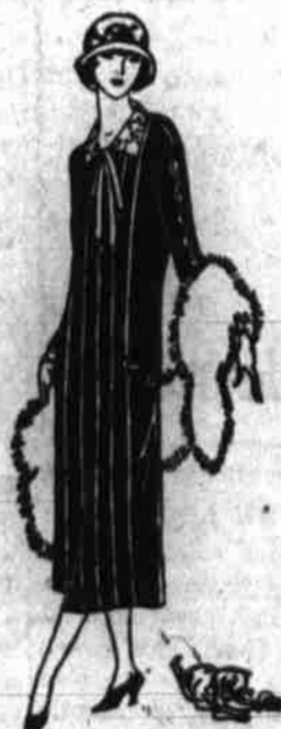
IRENE CASTLE CORTICELLI FASHIONS The DORCAS Model