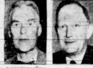
POSSIBILITIES — These two men, Christian A. Herter, left, and Douglas Dillon, are considered the best bets to replace John Foster Dulles as Secretary of State.

WASHINGTON (UPI)—Administration officials said today they expect Undersecretary Christian A. Herter to be named secretary of state within the next few days to succeed John Foster Dulles, who has resigned because of his illness. It has been generally understood that the 41-year-old former Massachusetts governor, who has been acting secretary since mid-February, would step into the job if Dulles had to quit. Some officials still conceded an outside chance to some other possible nominee—particularly C. Douglas Dillon, undersecretary of state for economic affairs.