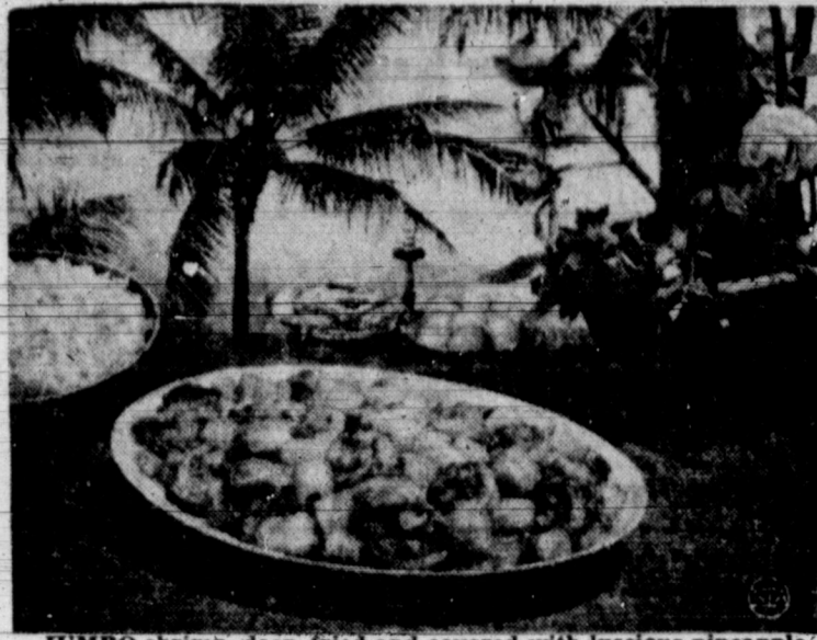
JUMBO shrimp, deep-fried and covered with luscious pineapple sauce, makes for elegant eating in Hawaii or any other place.

DEAR ABBY: I am 17 and a Junior in High School. I am 5 ft., weigh 110 and measure 35-34-35. I have blonde hair and wear glasses. I am a better than average student and take part in many school activities. I don't dress or act loud and have plenty of nice clothes. People say I have a nice personality. Everyone comes to me for advice about mother trouble and boyfriends and girlfriends. You're probably wondering what my problem is. Well, I don't have a boyfriend. Nobody ever asks me for a date. What can I do, Abby?