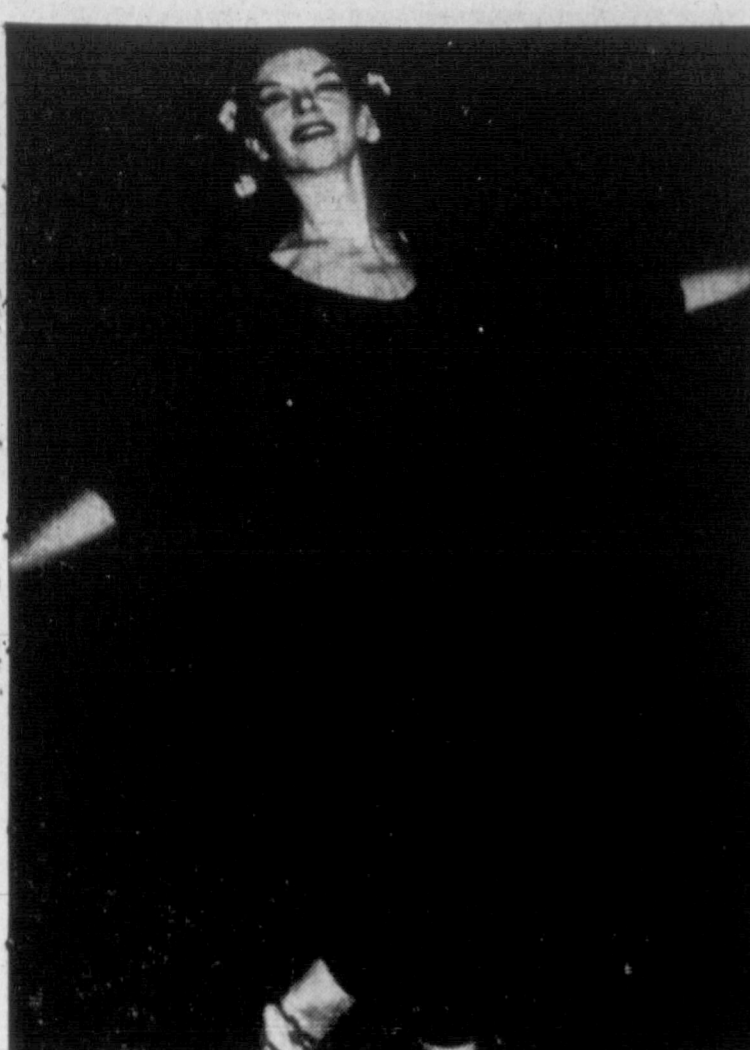
above to right they on given Photo)

If worried by "Bladder Weakness" (Get-it-Up Nixes or Bed Wetting, too frequent, burning or itching urination, secondary Backache and Nervousness, or Strong Smelling, Cloudy Urine, due to common Kidney and Bladder Irritations, try CYS-TEX for quick help. Safe for young and old. Ask druggist for CYS-TEX. See how fast you improve.