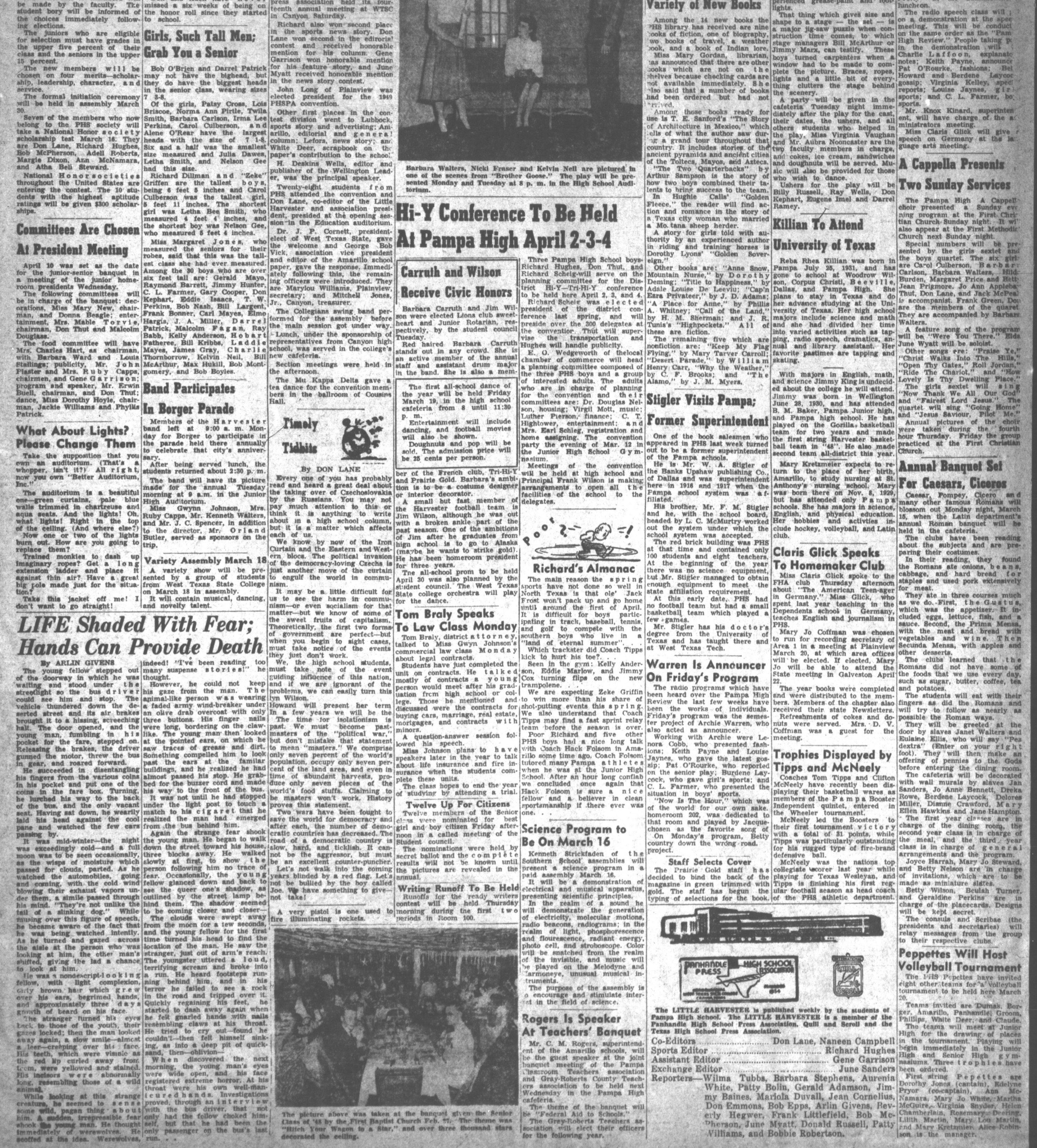
The picture above was taken at the banquet given the Senior Class of '48 by the First Baptist Church Feb. 27. The theme was "Hitch Your Wagon to a Star," and over three thousand stars decorated the celling.