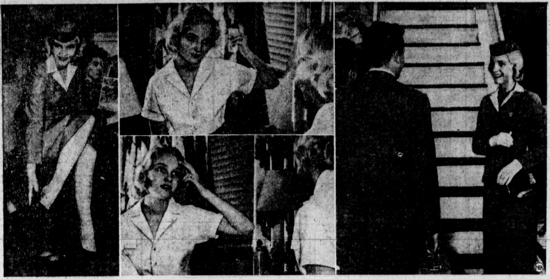
Looking fresh and pretty when you step from a plane after a long trip by air is no problem if you follow the beauty program which the stewardesses use. These girls work on each flight but must look neat and sparkling all through the trip and on arrival. The first thing this stewardess does is switch (left) from high heels to flat heels for comfort. This is a good trick for you, too. In the powder room, she applies hair spray (upper center) to keep her hair neat all through the flight. Then she uses a thin film of moisture-control cream under her foundation (lower center) to keep her skin from drying out. As she says goodbye to deplaning passengers (right), she is as pretty and well-groomed as she was at the start of the trip. And she has not spent hours to achieve this look.

SOUTHWESTERN BELL TELEPHONE COMPANY Call by number... it's twice as fast