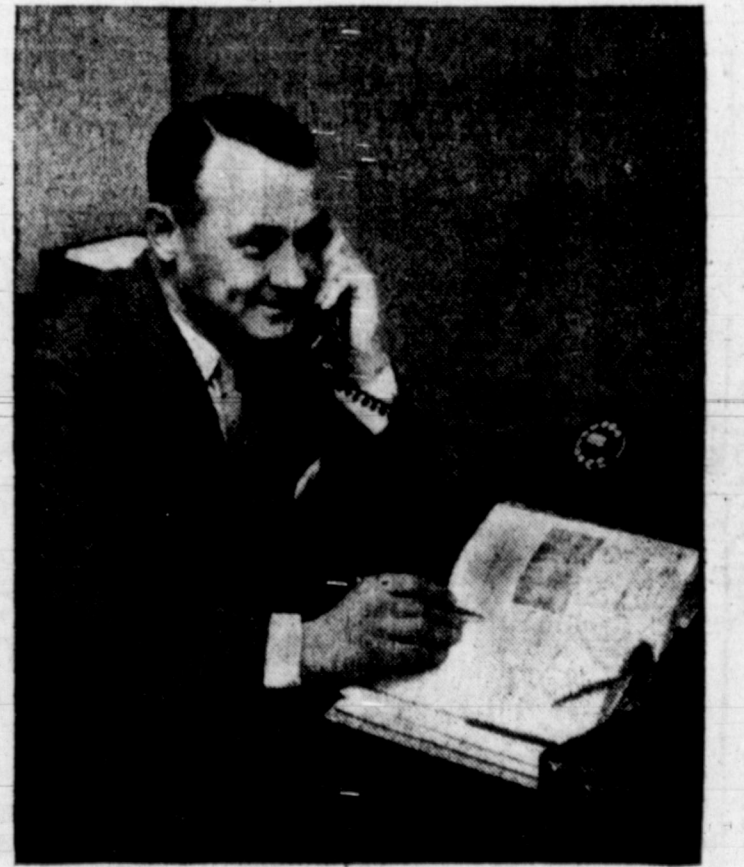
Smart businessmen list home, office numbers together in the directory, make it easier for customers to call.