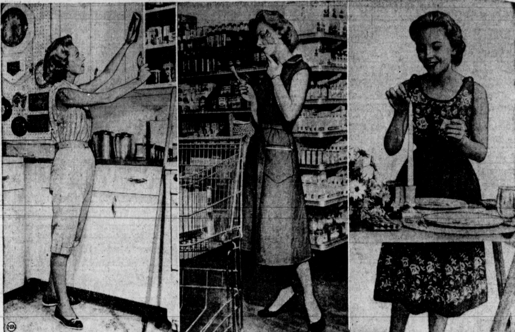
Being a housewife means holding down a many-sided job. Like any other job, it calls for a special wardrobe. For nothing is more damaging to the morale than looking and feeling like a household drudge in the castoffs from one's closet. This housewife (left) tackles her kitchen cleaning job with a special no-rinse cleanser for painted surfaces that cuts her working time in half. She dresses for her work in polished cotton satin pants and striped cotton blouse. For shopping at the supermarket, she wears a chambray dress (center) in cool gray. It has sailor collar and big pocket edged in red-and-white braid. When guests are coming for dinner, she dons a simple two-piece patio dress (right) in blue cotton chambray. Frosty white embroidery gives it a cool and fresh look. For this girl realizes the importance of looking attractive for those important people, her family and friends.