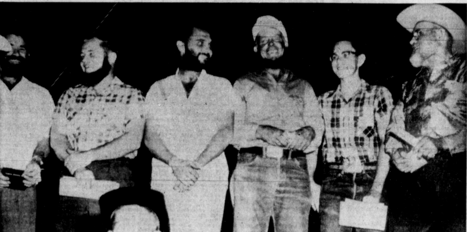
PRIZE BEARD GROWERS