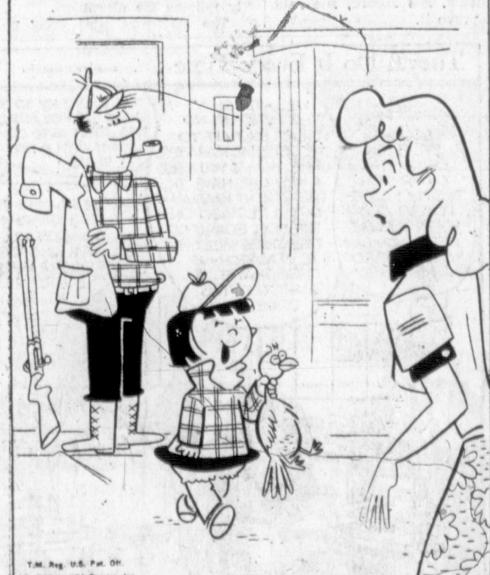
"He didn't have much luck at his duck blind-but he bagged this one at the corner meat market!"

(Continued From Page 1) here following her service in the