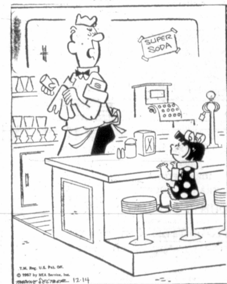
"No time payments—I want cold cash!"

A corridor guard is approaching, and you duck into one of the boys' toilets to avoid questioning. There you find the first visual evidence of the tension which still seethes below the calm surface of Central High School. Scrawled on the wall is a sign: "Nigger go home."