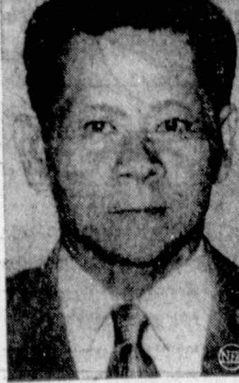
EXPELS DUTCH—Gustaaf Maengkom, justice minister of Indonesia, has ordered the expulsion of all Dutch nationals from his country. The Indonesian government also ordered the closing of all Netherlands consulates.