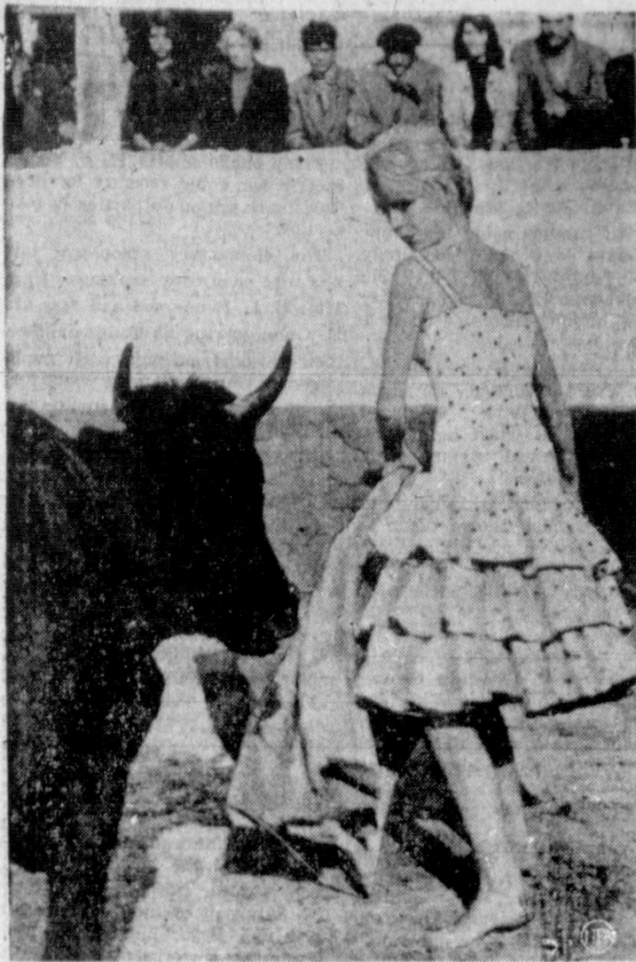
"WHO'S AFRAID OF..."—This determined, barefooted lady torador doesn't seem the least afraid of the fierce-looking bull. It's no wonder, for French actress Brigitte Bardot isn't in any danger at all. The bull's legs are securely tied to prevent his charging. The bull "fight" was a scene in the star's latest film, being shot at Nice, France.