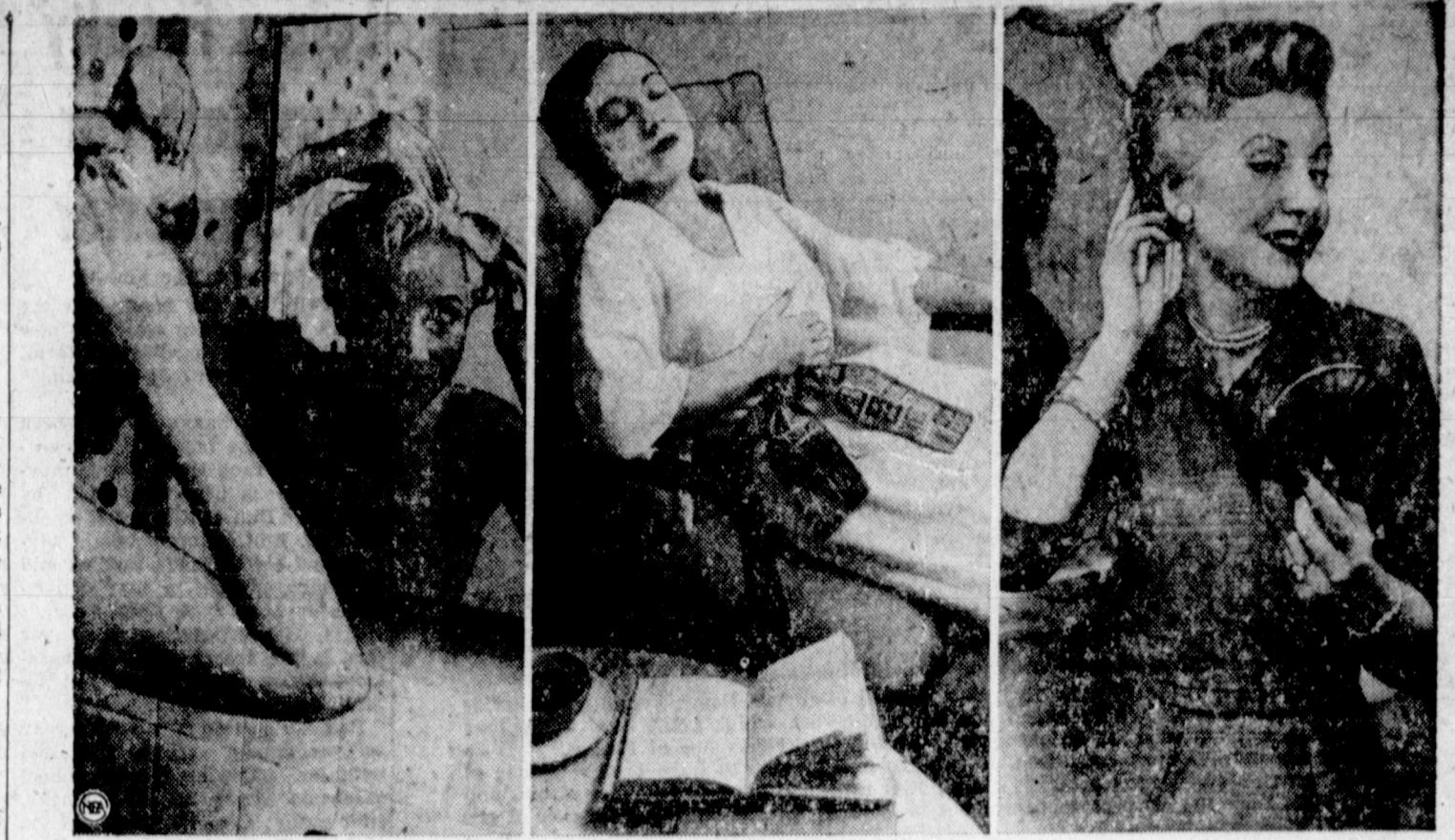
The good looks of the older woman depend to a great extent on persistent everyday care. Her poise, dignity and good grooming are her greatest assets and they make for great charm. This mature woman (left) shampoos her pretty silver-gray hair at least once a week, using a well-lathered sponge to scrub her scalp. Knowing that a clean skin glows, she gives herself a soap facial (center) and relaxes while she does it. She is careful (right) in her choice of clothes, adhering to those fashions that are simple in cut. She picks colors that will play up her gray hair, wears distinctive, simple jewelry.