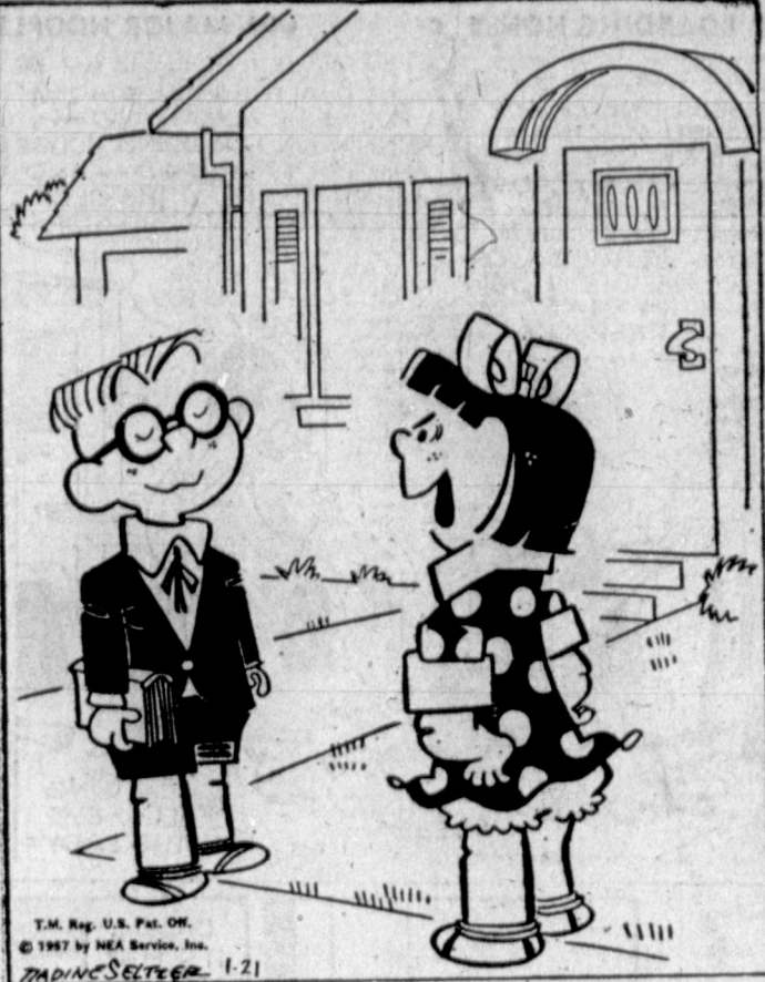
T.M. Reg. U.S. Pat. Off. © 1957 by NEA Service, Inc. Drawing by SEITZ 1-21

Penny for penny, sugar gives more energy than any other food item.