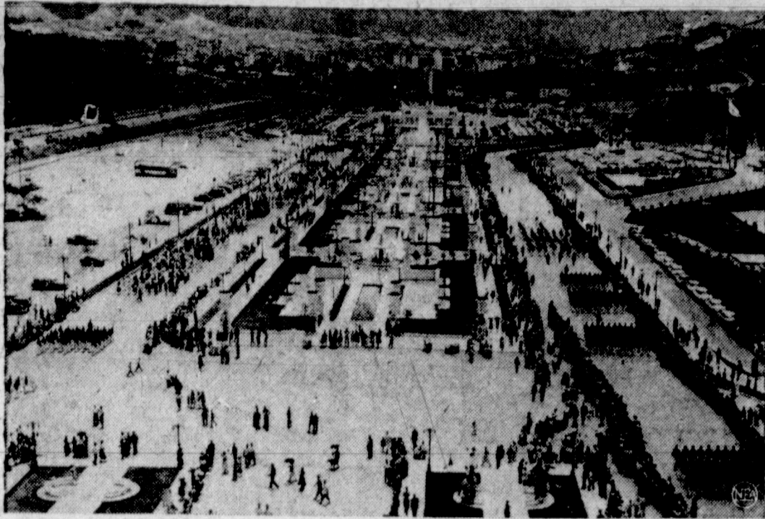
HEROES HONORED —Like a page from the archives of ancient Rome, Venezuela dedicates a breathtaking memorial to her statesmen and national heroes—high point in a week-long celebration of her 148th year of independence. Known as the "Avenue of Heroes," it is an 800-foot-long art extravaganza comprised of two 100-foot towers, 10 huge bronze statues of Venezuela's heroes, six reflecting pools, 84 giant flower urns, and dozens of smaller statues and fountains. More than 100,000 persons turned out in Caracas for the official dedication of the three-million-dollar memorial.