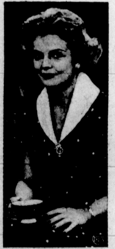
"PERFECT WIFE" —Marjorie Lord revives the "perfect wife" type as Danny Thomas' spouse in his television series. Marjorie says she was "too nice" for Hollywood parts of a few years ago. She's riding high now with a five-year contract as Danny's TV mate.

(Special to The News) PERRYTON — Installation of lighting was completed this week at the tennis courts at the city park here. Base lines are also to be repainted soon at the courts to get them in top condition. Illumination for both courts is provided by a total of 20 1500-watt bulbs mounted on eight poles. The lighting was a project of the Jennie June Club. Half the cost of installation was paid by the city, in accordance with a policy of matching funds for park improvements provided by civic clubs.