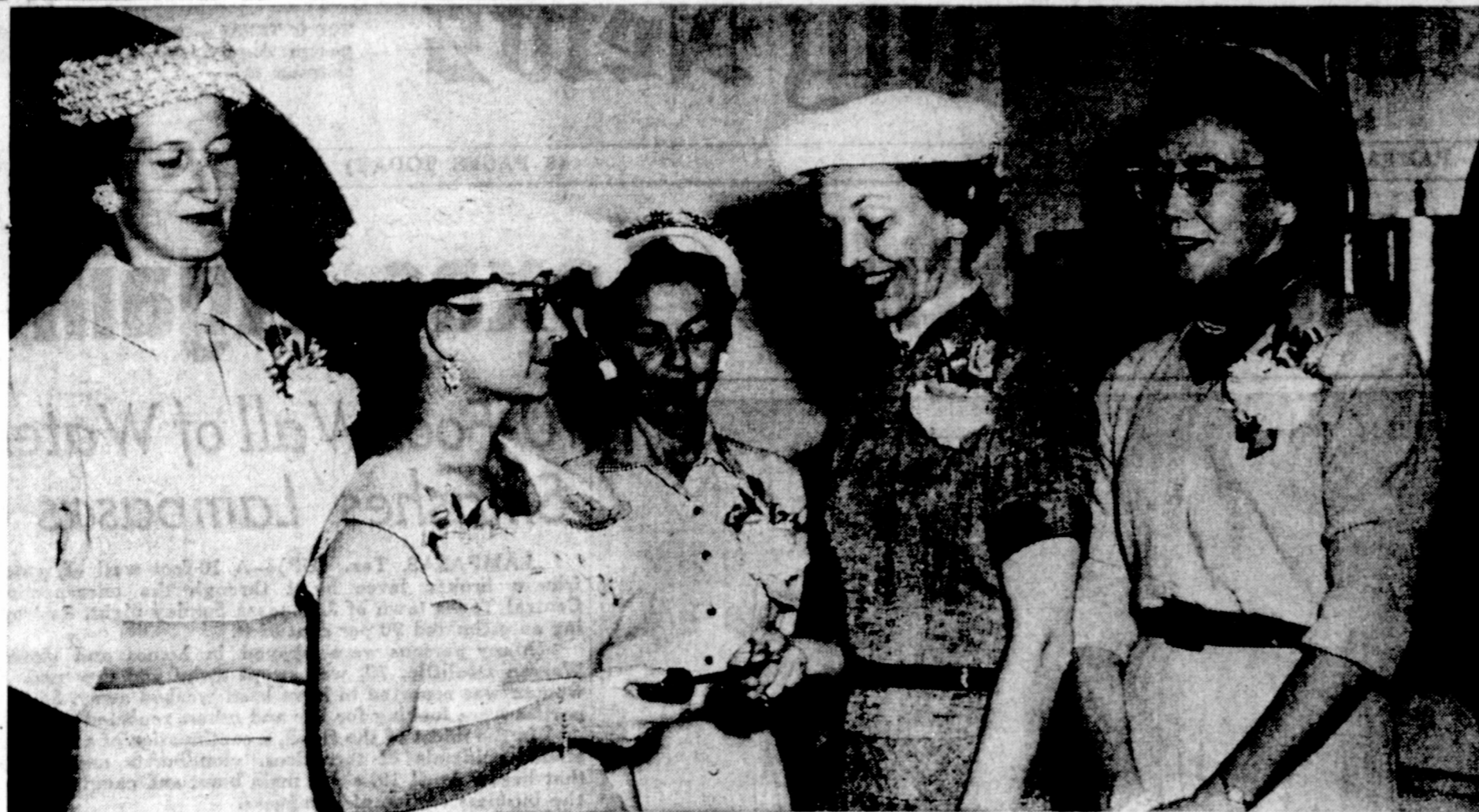
DISTRICT TEN ESA PRESIDENT