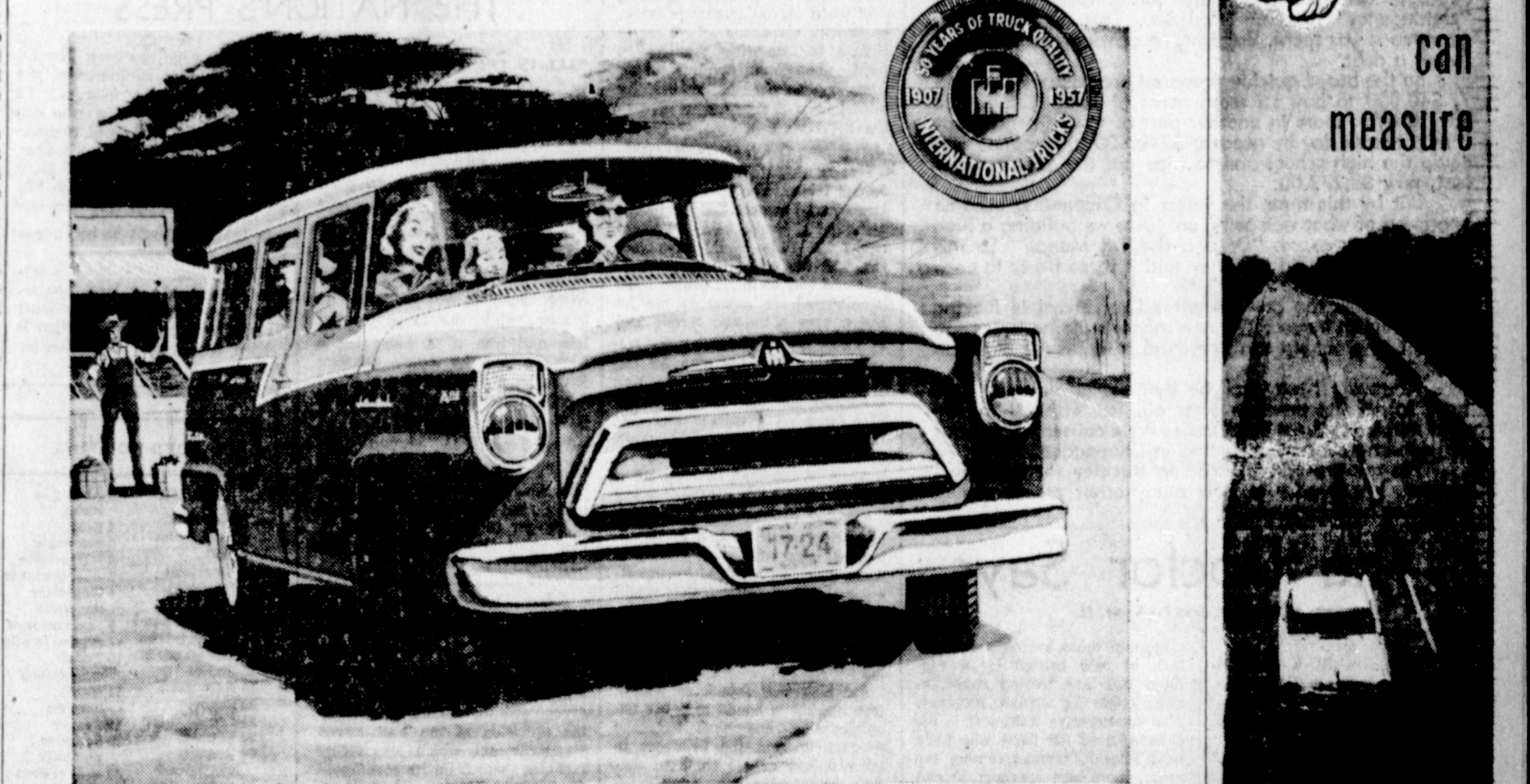
TRAVELALL — one of the Golden Anniversary line of INTERNATIONAL vehicles ranging from 1 1/2-ton Pickup Trucks through 33,000 lbs. GVW Six-Wheelers. Other INTERNATIONALS, to 96,000 lbs. GVW, round out world's most complete truck line.