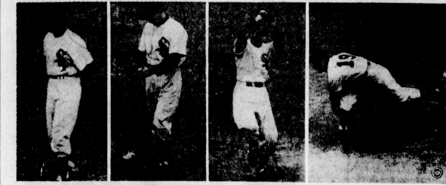
PIERCING —Billy Pierce didn't do so well in his last start against the Yankees, but remained the winningest pitcher in the majors with an earned-run average of 2.08. The White Sox left-hander hides the ball behind his back, steps on the rubber, pumps and fires. No trick stuff. Just the fast ball, curve and control. He figures to better his 20-victory output of 1956.