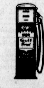
New Gulf Crest best ever sold for the finest cars ever built

Now, more than ever... to get the best from your car GO GULF