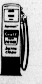
New Gulf Super No-Nox. for all but the most critical of today's engines