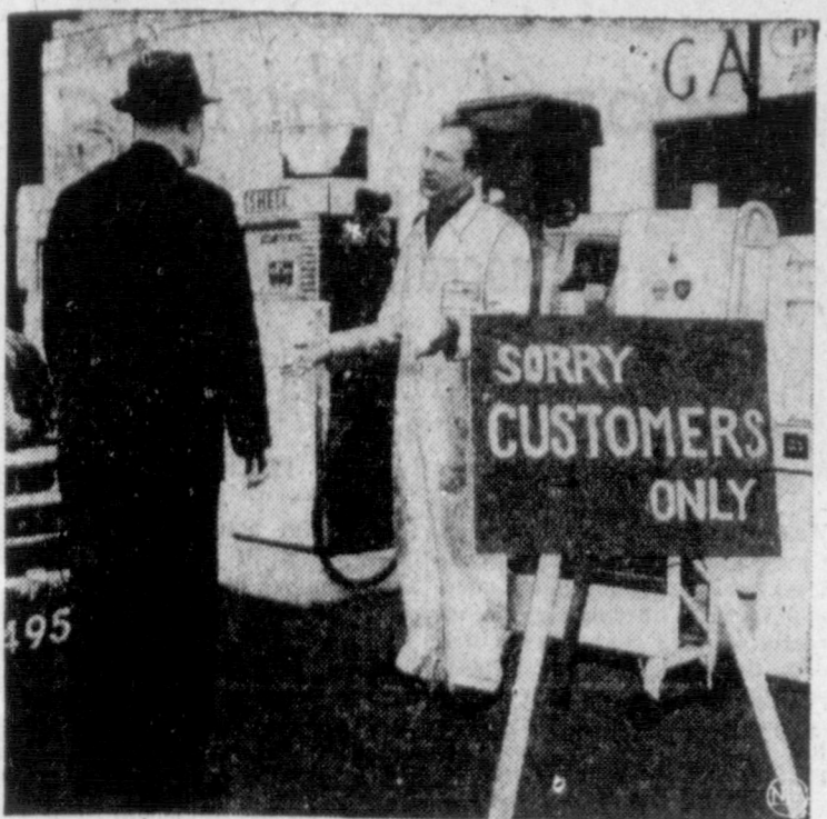
WAR ECHOES IN ENGLAND —Perhaps a hint of more drastic things to come is seen in this photo of a London garage-man explaining to a would-be gasoline buyer that he has only enough gas to take care of his regular customers. With supply of Mid-East oil already cut 10 per cent, and the Suez Canal blocked, forcing tankers onto the long route around Africa, the British government has already taken steps to curtail the consumption of oil and gas.