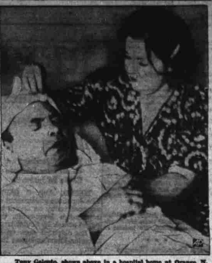
Tony Galento, shown above in a hospital home at Orange, N. J., with his wife, Monday suffered a relapse in his battle with pneumonia...