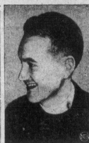
PRIEST IN THE FAMILY—Avery Dulles, 37, the youngest son of Secretary of State and Mrs. John Foster Dulles, will be ordained a Jesuit priest on June 18th by Francis Cardinal Spellman at Fordham University, New York City. Young Dulles entered a Jesuit novitiate in 1945 and has been studying for the priesthood since that time.