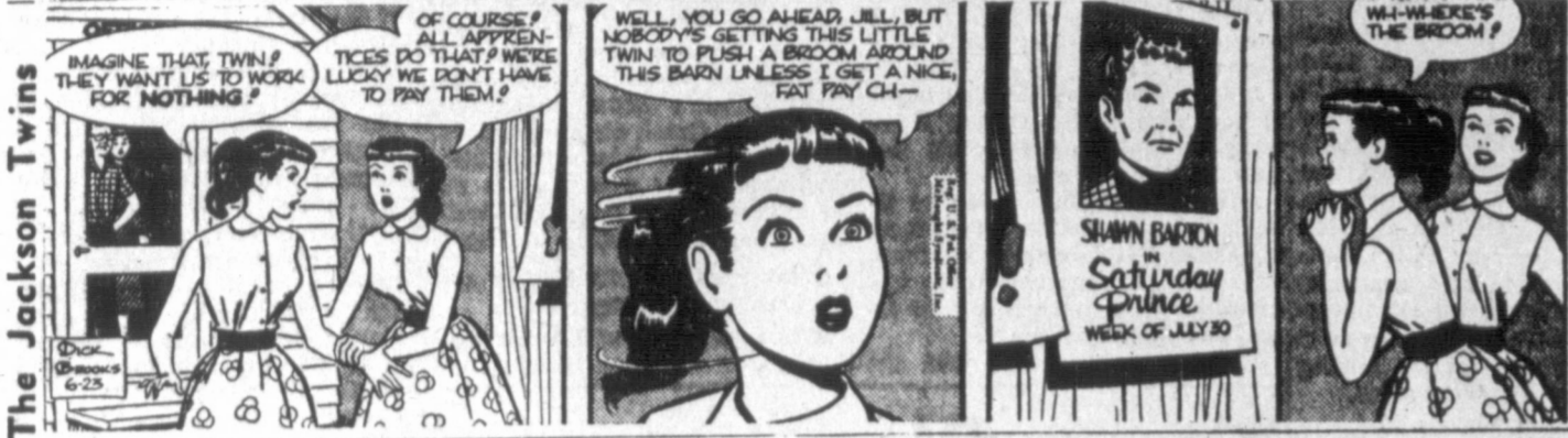
The Jackson Twins