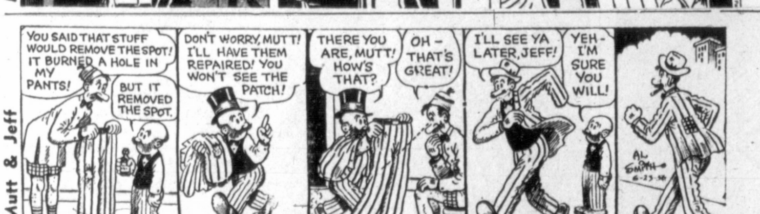
Mutt & Jeff