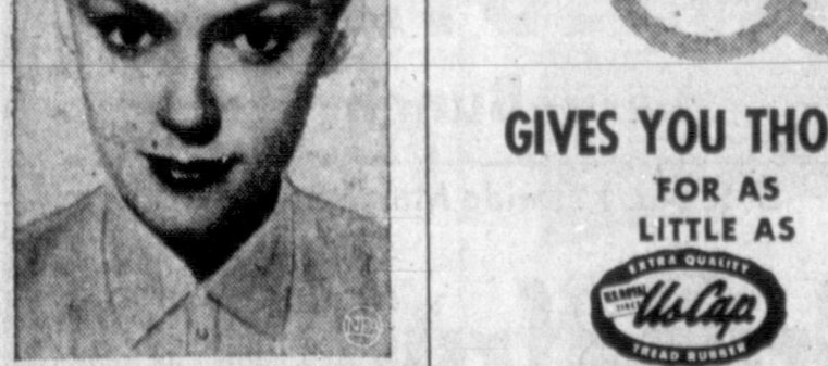
HERSELF NOW—Pretty Peggy King, the singer who has often been mistaken for Judy Garland, is escaping the "Second Judy Garland" tag. And she's happy about it, saying the tag "made me a has-been before I was a been." She's now in high gear as Peggy King.

One last thing she objects to: Being called a fisherman's daughter.