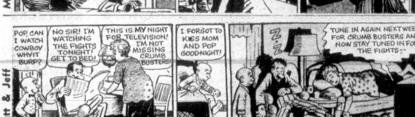
Mutt & Jeff