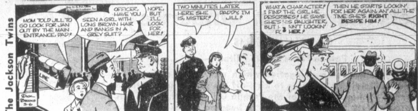
The Jackson Twins