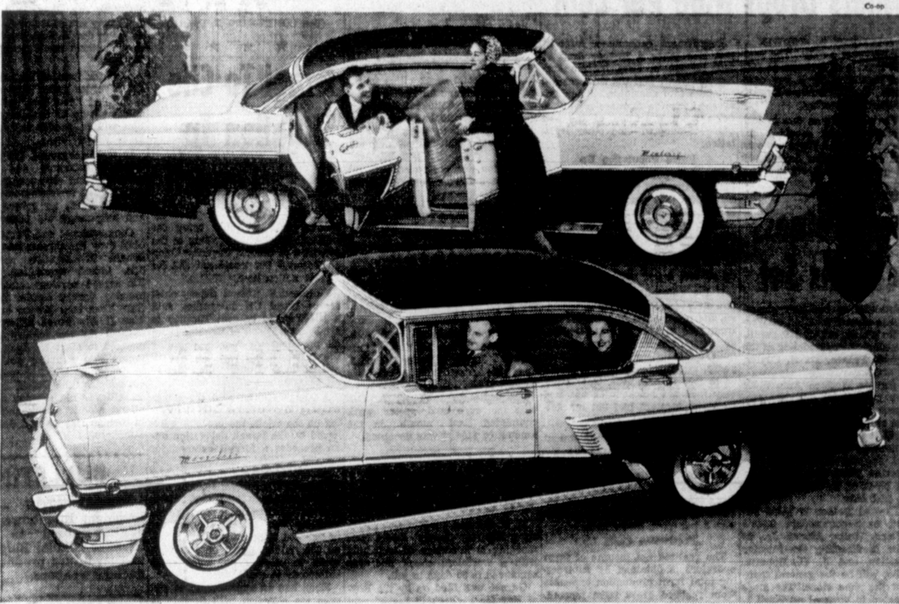
THE NEW MONTCLAIR AND MONTEREY PHAETONS—No center pillars, of course. But more important, no view-cramping curve of the roof—only the whole wide world to see.

Newest, most advanced design in 4-door hardtops. Available in Montclair, Monterey, or Custom series.