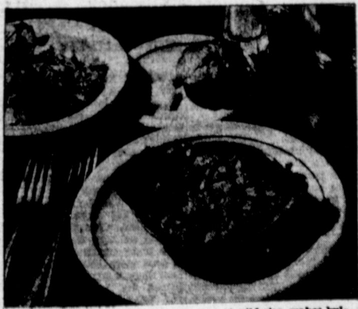
NUTTY FLAVOR, something like that of wild rice, makes bulgur, new packaged product, excellent ingredient for casseroles.

When packing a car for a trip, put the things that won't be used along the way in the trunk and keep only bags containing traveling clothes in the front.