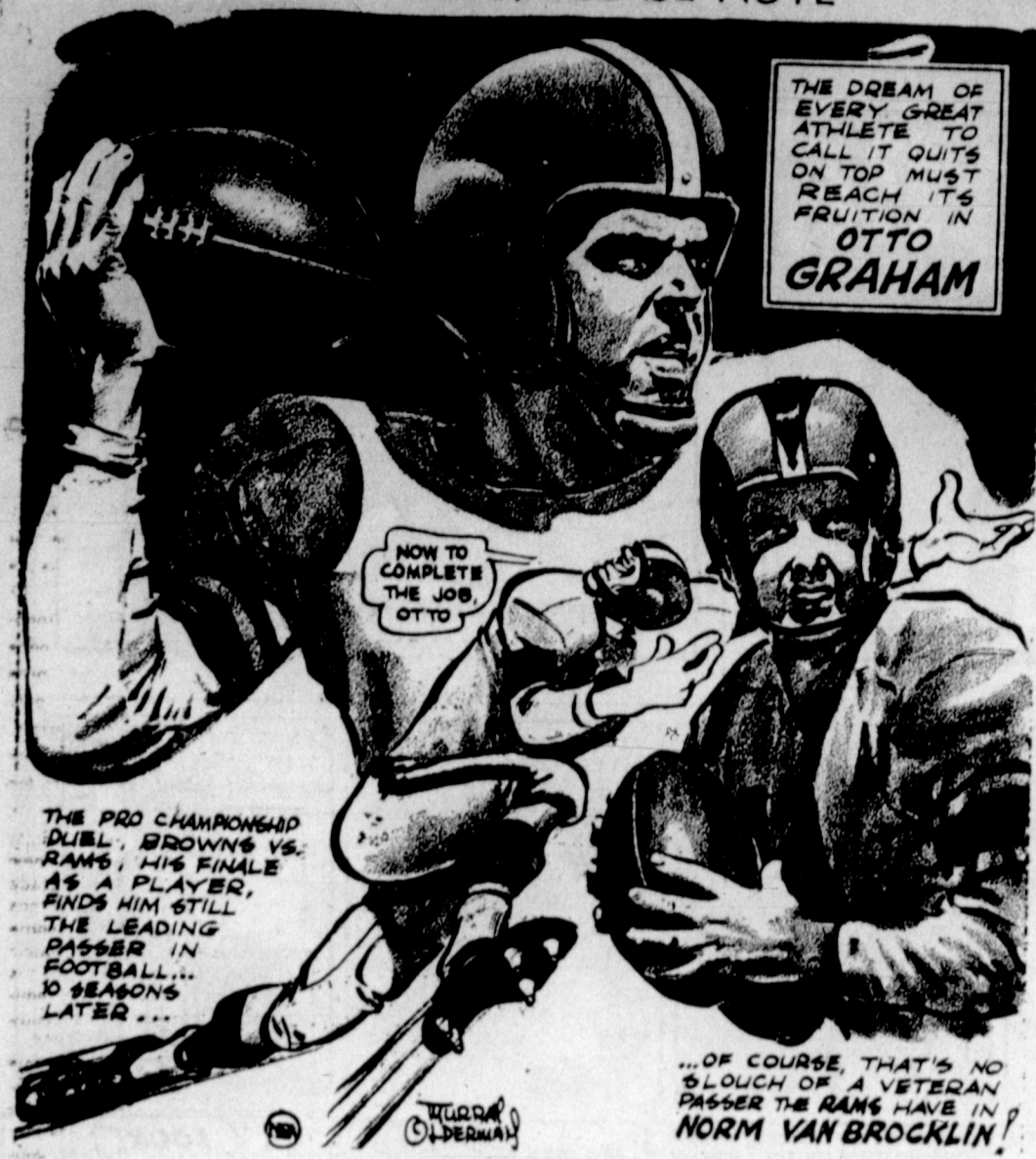
THE PRO CHAMPIONSHIP DUEL, BROWNS VS. RAMS, HIS FINALE AS A PLAYER, THE LEADING PASSER IN FOOTBALL... 10 SEASONS LATER...