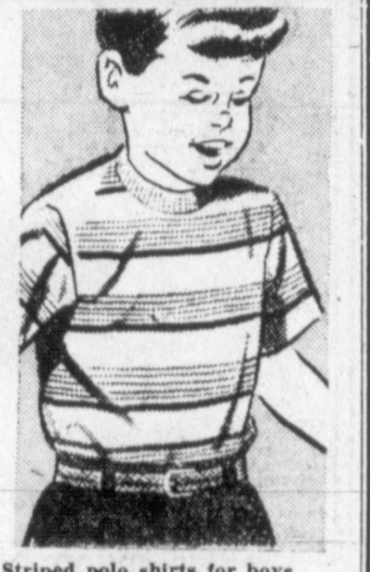
Striped polo shirts for boys... now anniversary priced! Fine combed cotton with crew neck, short sleeves. Famous full-cut-for-action Penney fit. Sizes 4 to 12.