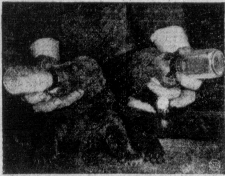
ASSEMBLY-LINE FEEDING —Just placed on public exhibition, two rare hybrid bear cubs, two months old, are bottle-fed at the Washington, D.C., zoo. The cubs' parents are also hybrids, offspring of an Alaskan brown bear and a polar bear. Third cub in the litter died.