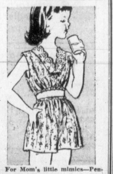
For Mom's little mimics—Penney's anniversary priced plisse pajamas, midriff and shorts in posie print or solid tints. Machine wash, scorn the iron. Sizes 6-16. Penney Special 1.00

White Hankies White only. Full size. 10 for 1.00