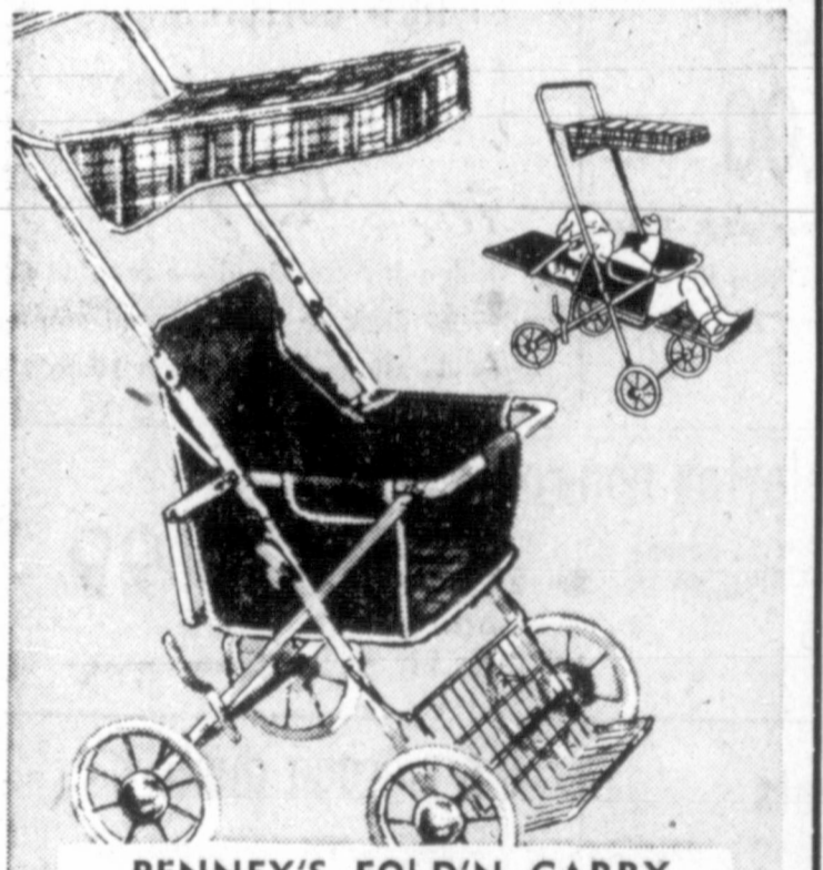
PENNEY'S FOLD'N CARRY SLEEPER ROLLER Anniversary priced for wide-awake Moms — Penney's sturdy, light-weight stroller. Adjustable back lets baby sit or sleep in canopy shade. Stroller folds flat for easy storage. Royal blue twill and plaid. Penney Special 8.88

Young Men's JEANS Heavy 13 3/4 ounce western cut. Size 28 to 34. 1.66