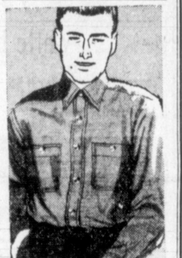
Men, save plenty on Penney's 4.4-ounce chambray work shirts. Full cut for comfort, strong stitching for durability. Sanforized!