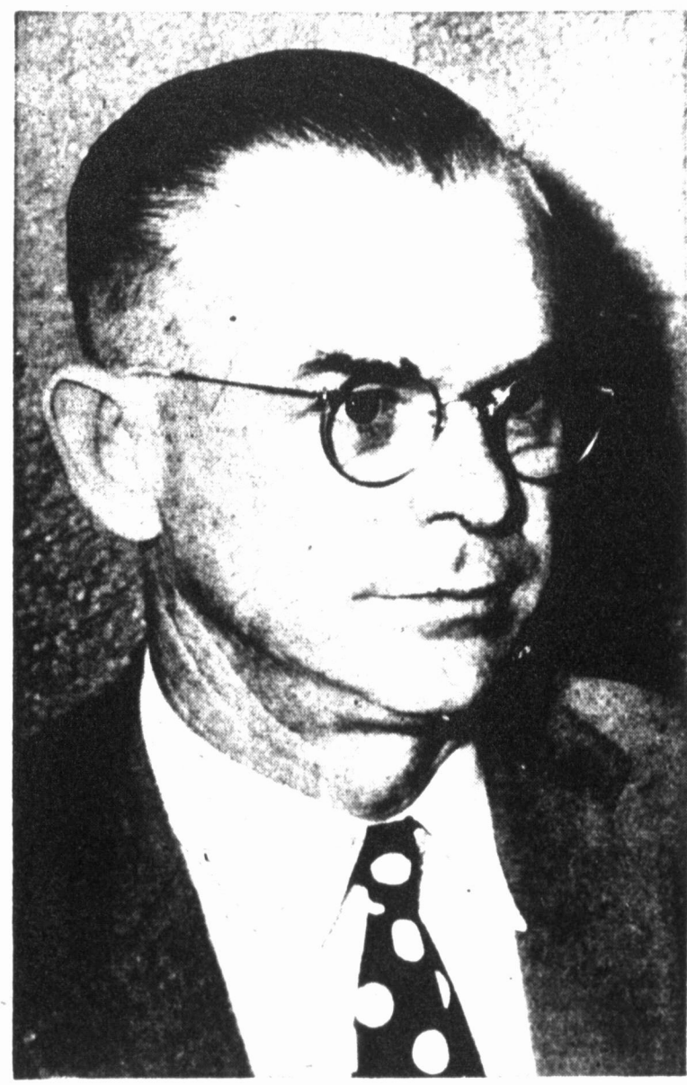
... service comes first