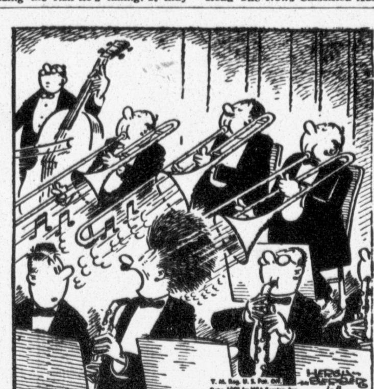
"Every time I get a haircut I catch cold sitting in front

safe, right now, without even realizing the risk he's taking. It may Read The News Classified Ads.