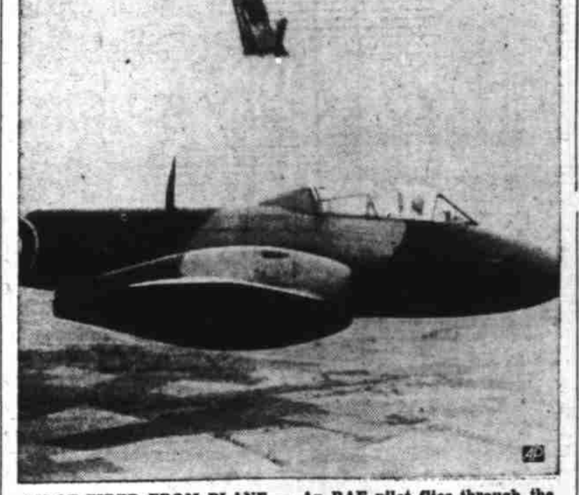
RAF FIRED FROM PLANE — An RAF pilot flies through the air on his pilot-ejection seat at 60 feet a second after being thrown from his jet plane by a cartridge which, when fired, tosses him and his seat from the plane.