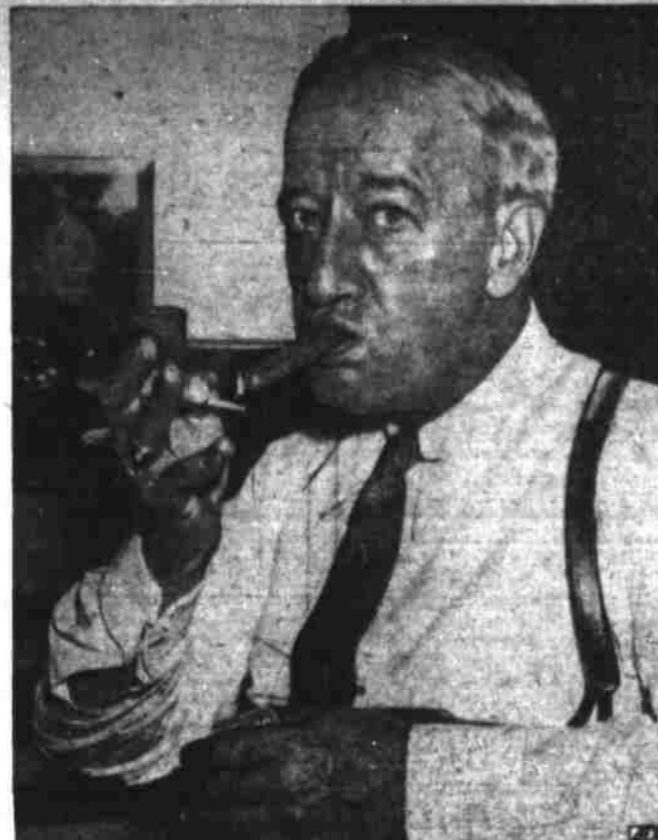
WALKING WEATHER —Al E. Smith (above), the "Happy Warrior" and former Democratic presidential nominee who "took a walk" on Roosevelt's candidacy in 1936, is still walking. In New York, he pledged support to Willkie.