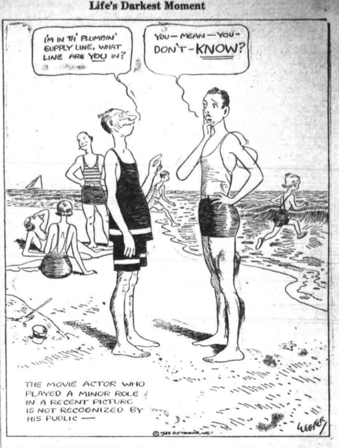
THE MOVIE ACTOR WHO PLAYED A MINOR ROLE IN A RECENT PICTURE IS NOT RECOGNIZED BY HIS PUBLIC

Steve's eyes were fastened on the strip of asphalt ahead, the glittering panorama of the city, the pyramids of lighted dots reaching into the sky.