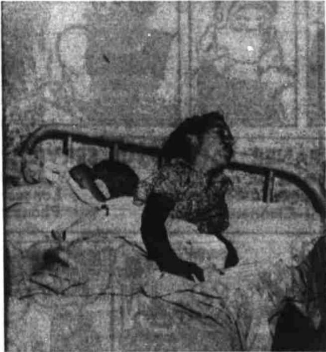
7 a.m. A mother calls, and your newspaper boy struggles out of bed. Washed, dressed and combed, in a little while he'll be all set for a big breakfast of energy that will start his day right.

is packed with study, work and play. He's big or small, fat or thin, his shoe is size 5 or 9 . . . he's an all American boy . . . a solid citizen of the future . . . he's your newspaper boy.