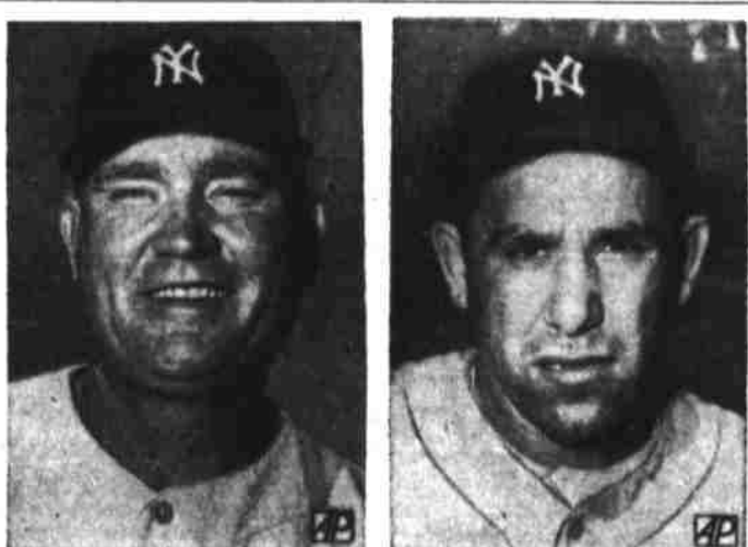
JOHNNY MIZE ... Smash Home-Runs For Yankees In Defeat