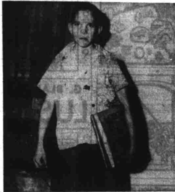
8 a.m. On his way . . . books in hand, he's in for a day of classes in one of the local schools . . . preparing himself for years of usefulness ahead. He'll be on time, for promptness is one of his qualities.