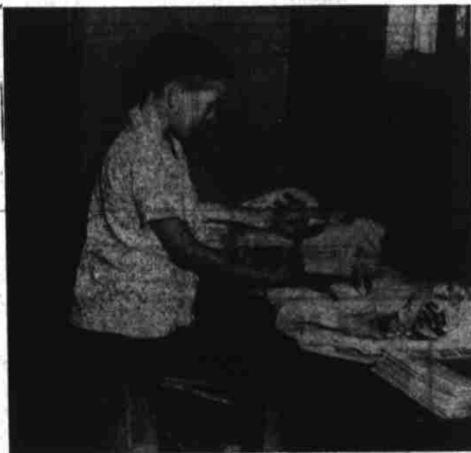
4 p.m. Out of school he begins his job . . . counts and sacks his papers, and starts the day's deliveries, assuming his responsibility for bringing the news to his share of the families in the Big Spring area.