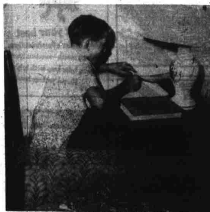
7:30 Off to his room for an evening of study, gleaming knowledge from his books and preparing himself to learn more. He seeks the knowledge that becomes the foundation for greater thought and greater usefulness.