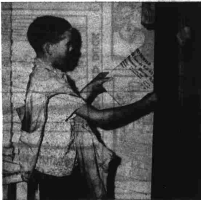
4:30 Promptness, respect for property and courtesy are points in the character of your newspaper boy . . . building a sense of duty and responsibility to make a fine citizen of the future for his community.