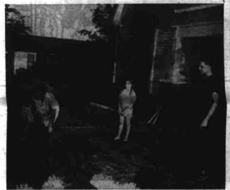
5:30 Fun and relaxation are part of the day for your newspaper boy. His day's delivery done, he can enjoy some moments of leisure or play with members of his family, getting the recreation needed for a healthy mind and body.