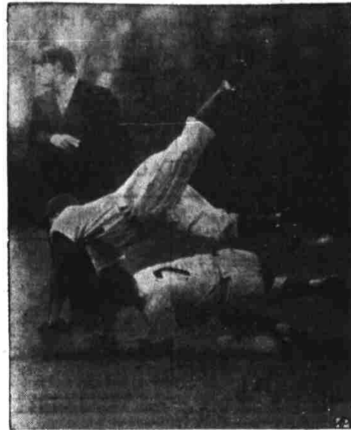
Peewee Takes A Nose Dive