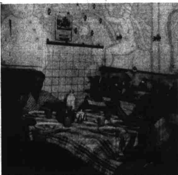
6:30 Back in time for dinner and some more moments in the "family circle." With his parents, brothers and sisters, he absorbs and is uplifted by the good nature and security of a wholesome home life.