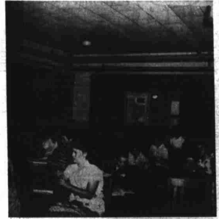
10 a.m. In school, he gets the facts of modern history, science, literature, grammar and mathematics. Alert and attentive, he gains a sound background that will keep his grades up, keep him available for his job.