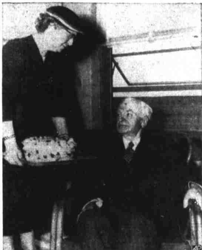
Cordell Hull Is 81

BIG SPRING AND VICINITY: Partly cloudy today, tonight and Saturday. Slightly warmer.