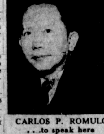
CARLOS P. ROMULO ...to speak here