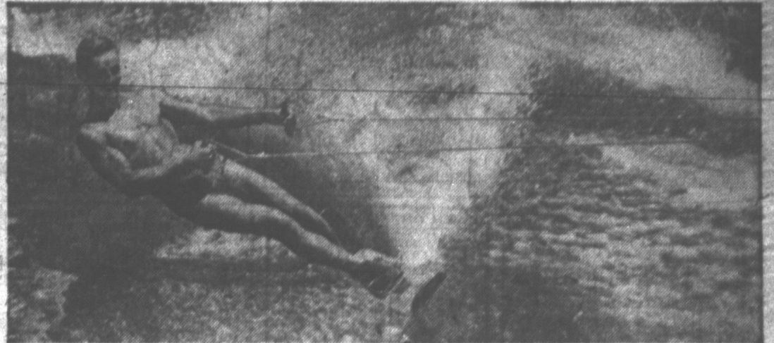
ONCE OVER LIGHTLY —Butch Rosenberg, of Miami, is stirring up a crystal fountain of spray at Cypress Gardens, Fla., as he practices for the National Water Ski Tournament to be held in New Hampshire in August. It's a good way to cool off while warming up.