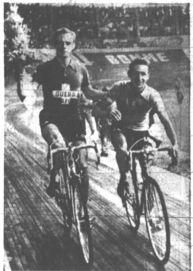
HELPING HANDS —Swiss bike ace Hugh Koblet, left, proudly carries the bouquet of flowers presented to teammate Carlo Clerici, right, winner of the tour of Italy bike race in Milan. A dark horse among the 106 riders in the cross-country ride, Clerici rode from Palermo to Milan in less than 130 hours.