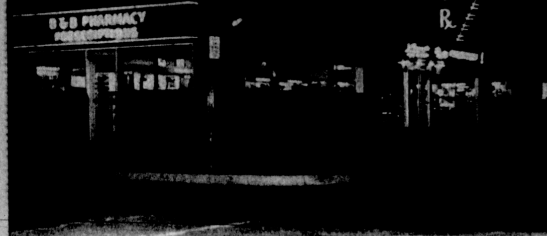
SHOP AT B & B

It's so easy to find "just the things" you want at B & B Pharmacy! There are thousands of gift suggestions in the cosmetic, toy, baby and gift departments for her, him, baby, them and for the home! Remember, there are two easy ways to shop B & B: visit this friendly pharmacy (Ballard at Browning) and enjoy shopping any time from 8 a.m. to 10:30 p.m. week days and Sundays. Or telephone B & B (4-5788), ask for shopping service, describe the gift you want, have it gift-wrapped and delivered to you by B & B's free, city-wide delivery service.