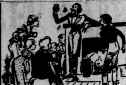
But Bob Cratchit's family was unmindful of the Spirit's prophecy. Generously, Bob proposed a toast to his miserly employer, Ebenezer Scrooge. Mrs. Cratchit refused to drink.