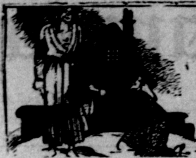
When he heard the Spirit of Christmas Present prophesy Tiny Tim's death, Scrooge was seized with panic. "No, no," he cried. "Oh, no, kind Spirit! Say he will be spared!"