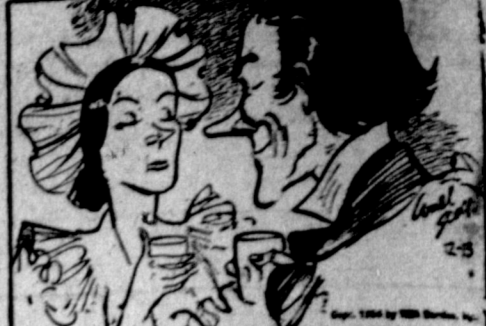
At last she gave in. "I'll drink to his health for your sake, Bob, and the Day's, not for his," she said.