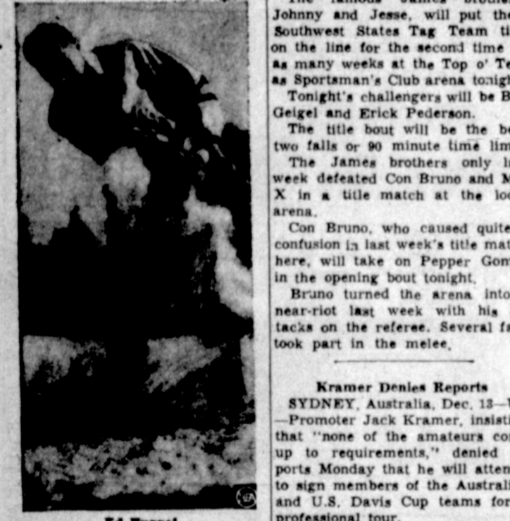
Ed Furgol falters at Miami after sharing third round lead.

Arkansas also plays Mississippi Little Rock Friday night while Baylor goes west for a two-night stand at Provo, Utah against B. I. & N. Young Friday and Saturday nights.