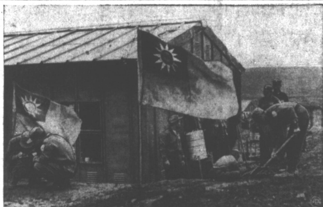
HOUSE THAT FREEDOM BUILT —Former Red prisoners of war who rejected communism set up housekeeping in Taipei, Formosa, following their release by the UN repatriation team. Elsewhere in Formosa and in South Korea, former soldiers of the Red Army are starting a new life under freedom.

found the house open. Officers indicated a charge of breaking and entering, and possibly other charges, would be filed against the three youths, who have juvenile police records. Read The News Classified Ads