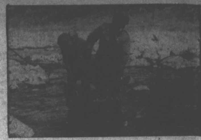
SWEEPING UP —Army combat engineers sweep a stream in Korea with a mine detector. After the armistice was signed, clearing mines from old battlegrounds became a major task.