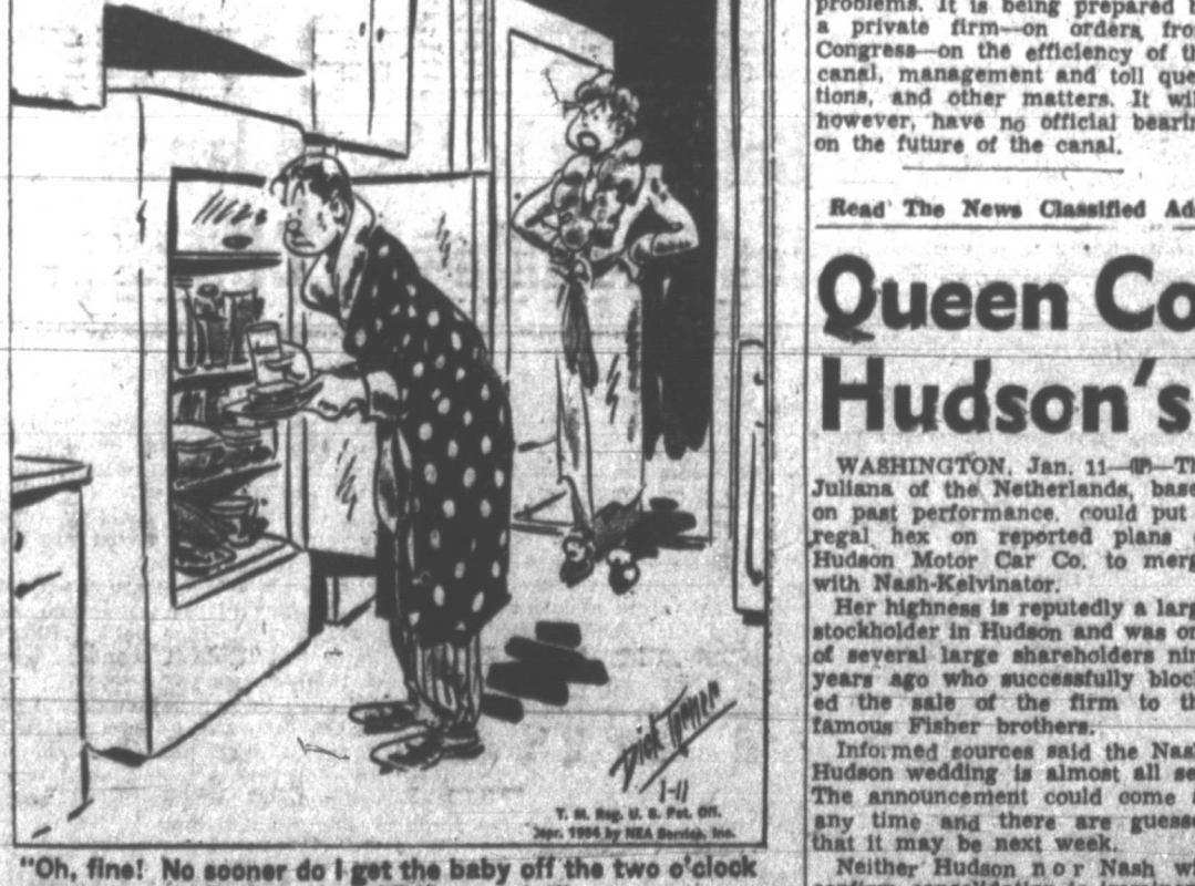
"Oh, fine! No sooner do I get the baby off the two o'clock feeding than YOU start in!"

When a body break occurs in conventional tires, the flexing of the cords will eventually pinch the tube which, being under tension, will tear and explode. The new Firestone tire also protects you against dangerous skids. The scientifically designed tread with thousands of sharp non-skid angles, plus molded skid