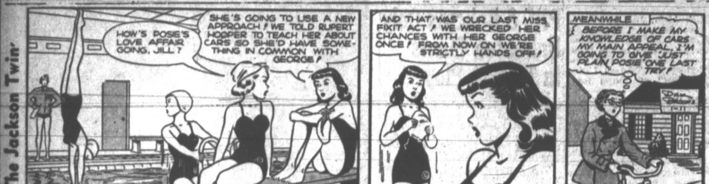
The Jackson Twin