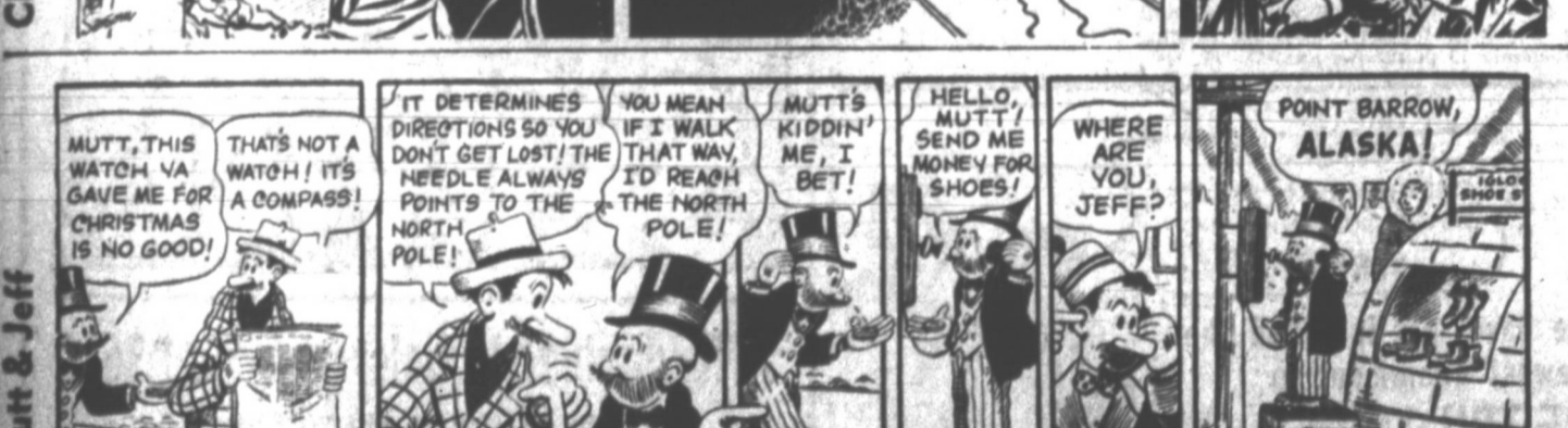
Mutt & Jeff