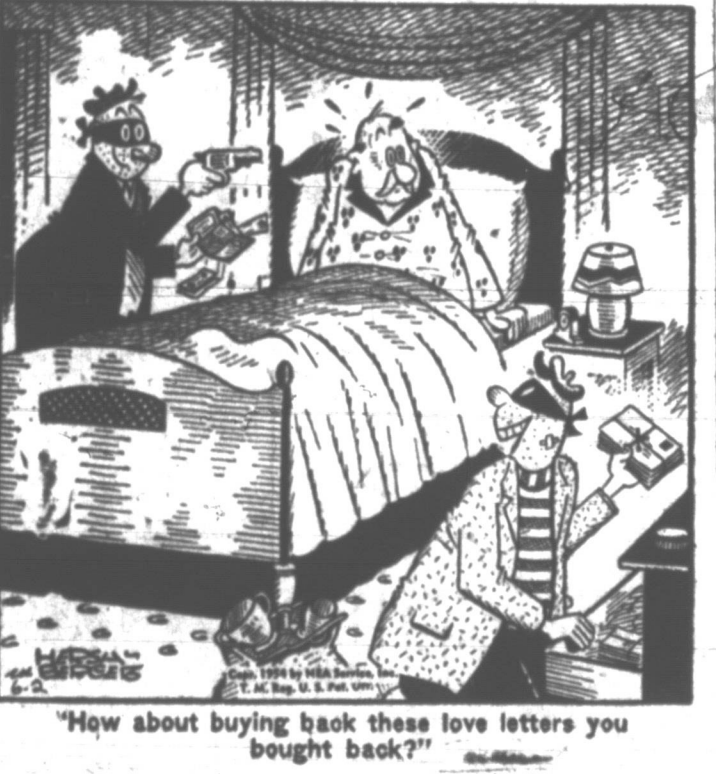
"How about buying back these love letters you bought back?"

6:00-6:15 Panhandle Farm Roundup 6:15-6:30 Halls of Music 6:35-6:50 Halls of Music 6:55-7:10 Halls of Music 7:15-7:30 Halls of Music 7:35-7:50 Halls of Music 7:55-8:10 Halls of Music 8:15-8:30 Halls of Music 8:35-8:50 Halls of Music 8:55-9:10 Halls of Music 9:15-9:30 Halls of Music 9:35-9:50 Halls of Music 9:55-10:10 Halls of Music 10:15-10:30 Halls of Music 10:35-10:50 Halls of Music 10:55-11:10 Halls of Music 11:15-11:30 Halls of Music 11:35-11:50 Halls of Music 11:55-12:10 Halls of Music