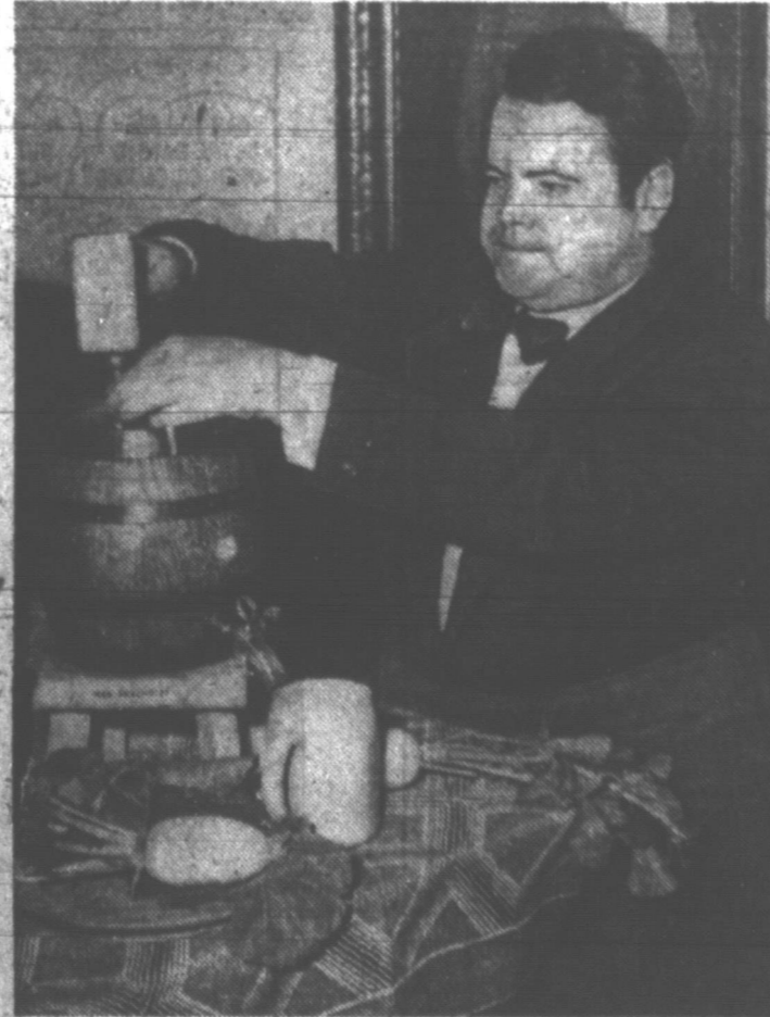
BEER BARREL POKER —Actor Orson Welles took a hammer in hand to tap a brand new barrel of Bavarian beer as he prepared to partake of supper after a day before the camera in Munich, Germany. These tiny barrels are the newest attraction in the local beer cellars and greatly admired by tourists.