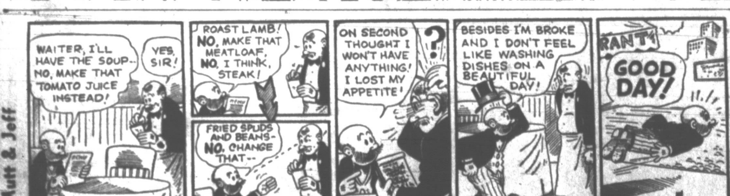
Mutt & Jeff