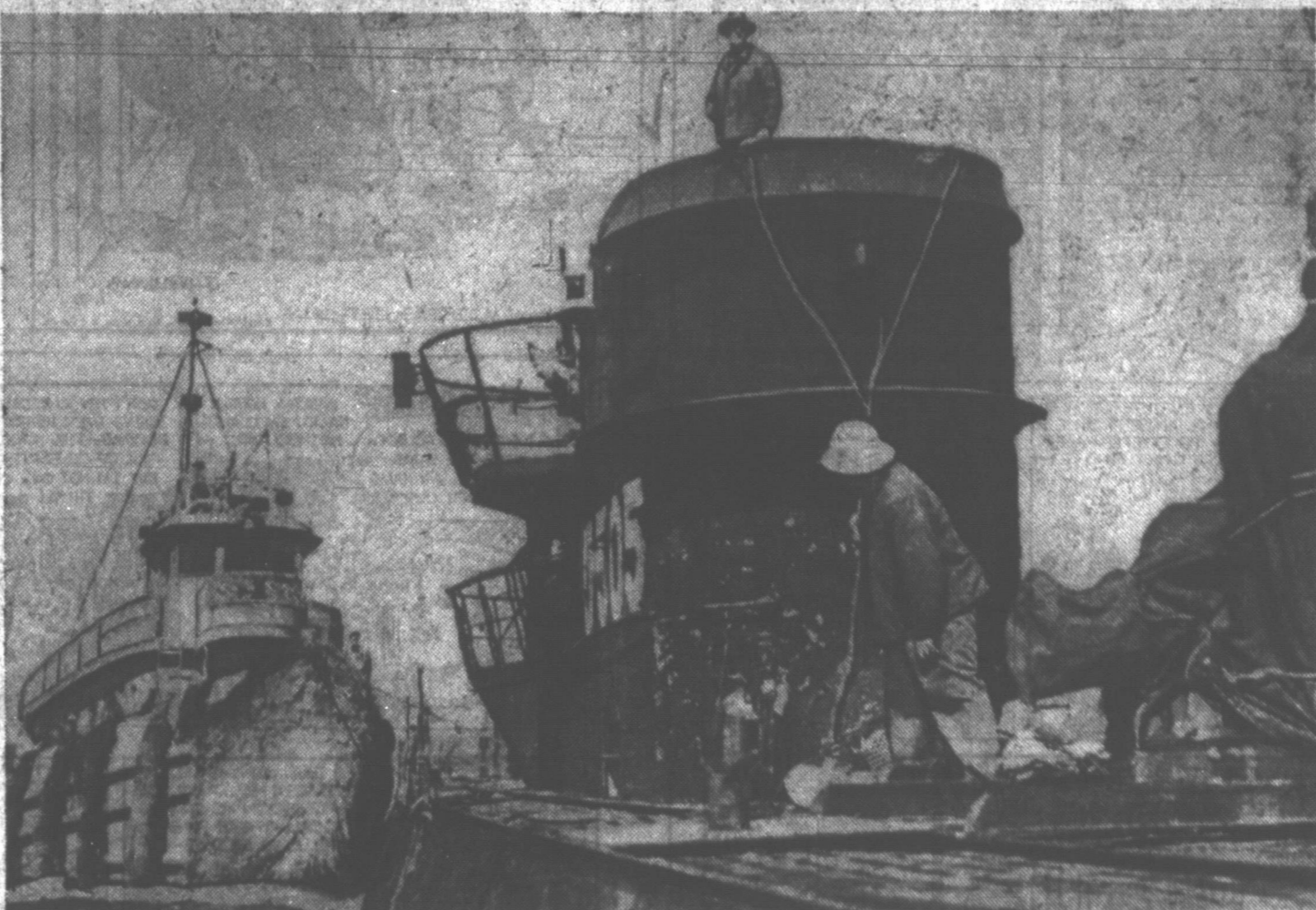
NAZI RELIC —The Nazi submarine U-505, in foreground, was pushed by tug as she started from the Naval Yard in Portsmouth, N. H., to Chicago to be exhibited at the Museum of Science and Industry. The 505 was towed through the St. Lawrence River, the Welland Canal and Great Lakes to Chicago. Captured off the coast of French West Africa, June 4, 1944, the U-505 was the first warship captured on the high seas by the U. S. Navy since the War of 1812.