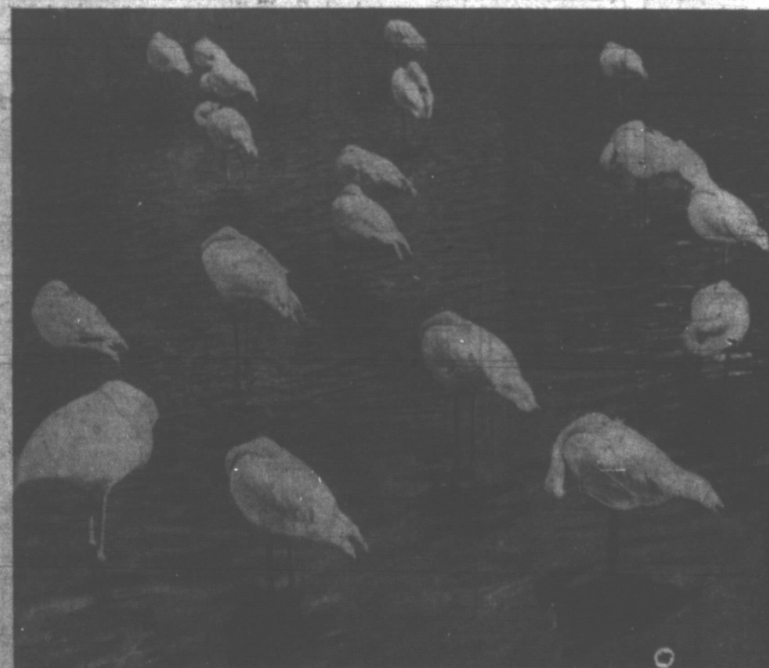
SIESTA TIME —Those pink flamingoes at the Vincennes Zoo in Paris look as if they had eaten too much lunch as they lay their heads on their backs for a nap. They stand in the sun to stay warm, and the water over their feet keeps that part of their bodies cool.