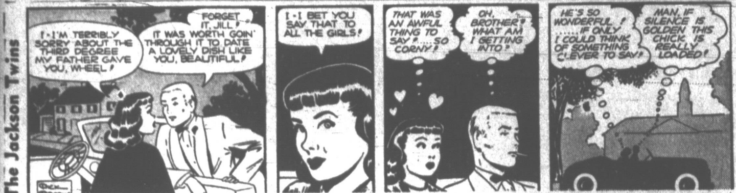
The Jackson Twins