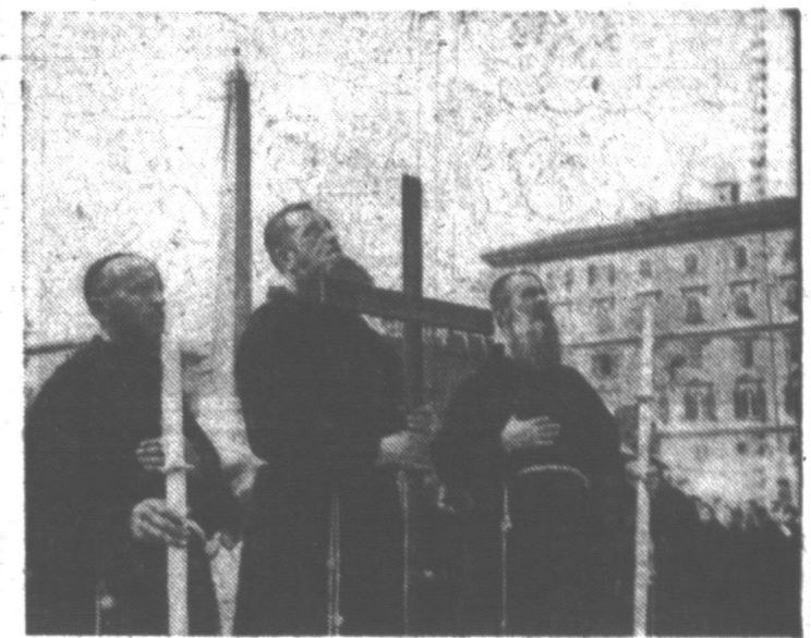
SAYING A PRAYER —Three Capuchin monks gaze up at the decorations on Rome's St. Mary Major, where they came to attend a special Mass in celebration of the Marian Year. The Eternal City expects many visitors from everywhere this year.