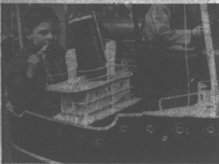
A WHEEL OF FUN —They're both "carrousel" in Paris, and merry-go-round in the U. S., but both spell FUN in any country. A Parisian lad, top photo, is maneuvering his scale model tractor through carrousel traffic as another boy, below, is seemingly content to board an ocean-going craft while he nibbles a bit of taffy. Grown-ups remember what the kids are doing.