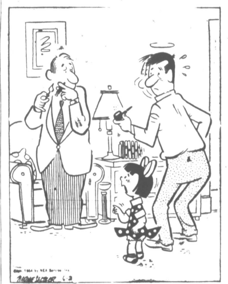
"Where's the wagon Pop said you were on?"