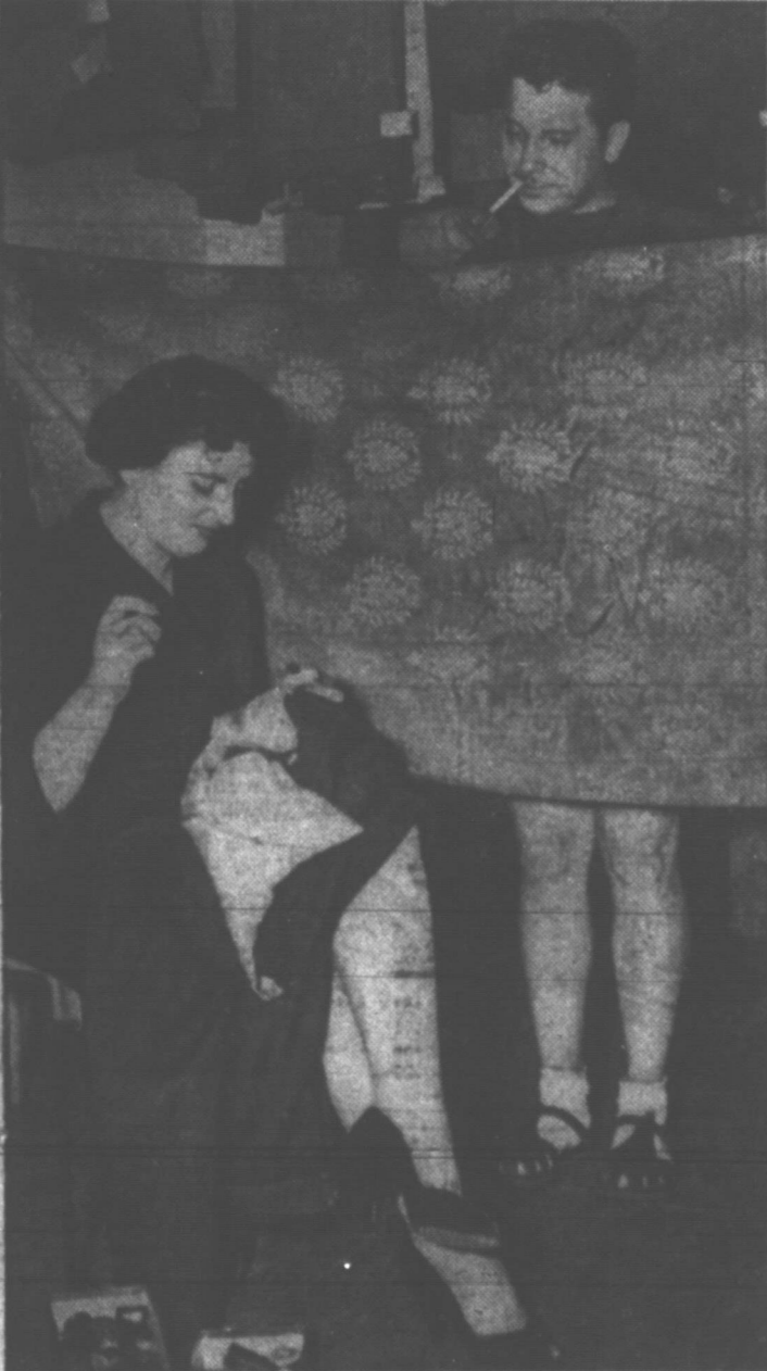
A STITCH IN TIME —An establishment in Paris which caters particularly to bachelors is doing terrific business. As this gentleman waits behind a curtain, his pants are being mended. The company cleans clothes, sews on missing buttons, and darns socks while customers stand by. It's no wonder that bachelors realize their good luck and patronize the place.