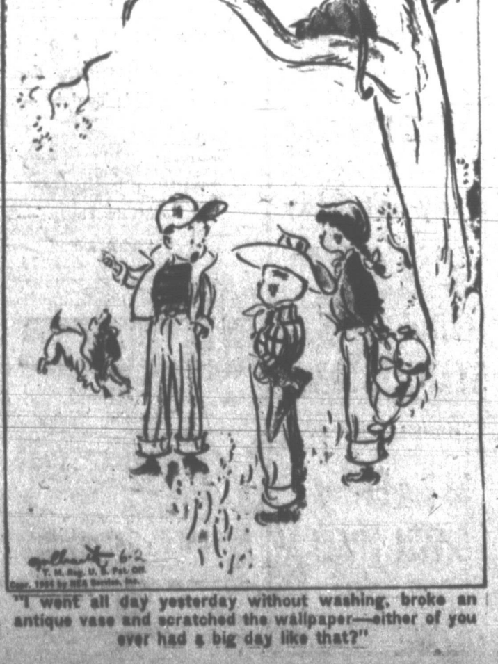
"I went all day yesterday without washing, broke an antique vase and scratched the wallpaper—either of you ever had a big day like that?"