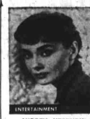
PEARL S. BUCK