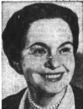
OVETA CULP HOBBY