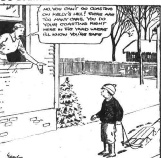
LIFE'S DARKEST MOMENT