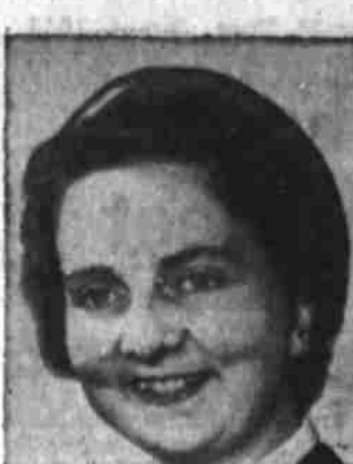
Genevieve De Galard-Terraube