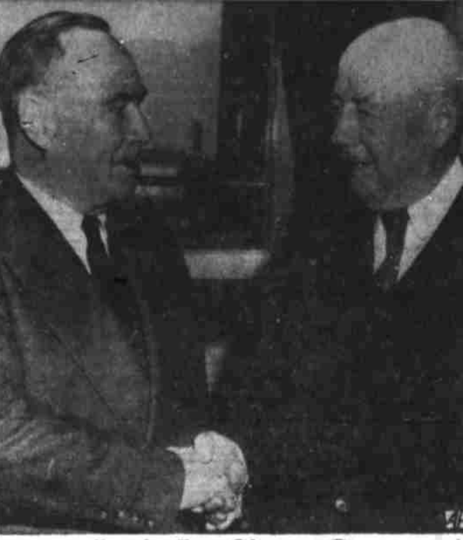
Retiring House Speaker Joseph Martin (R-Mass), left, and the man who will succeed him, Rep. Sam Rayburn (D-Tex), shake hands as they meet in Washington to talk over the opening of the new session of Congress on Wednesday.

WILLS POINT (U-P) — This little town on the edge of deep East Texas voted today on a far-reaching water issue.