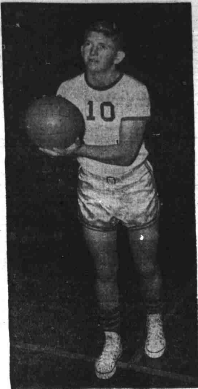
Rams' Chief Threat