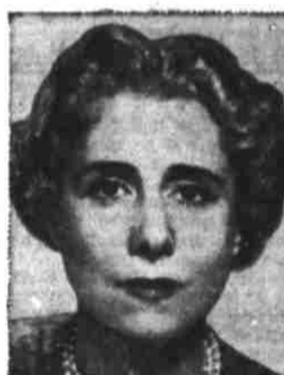
CLARE BOOTH LUCE