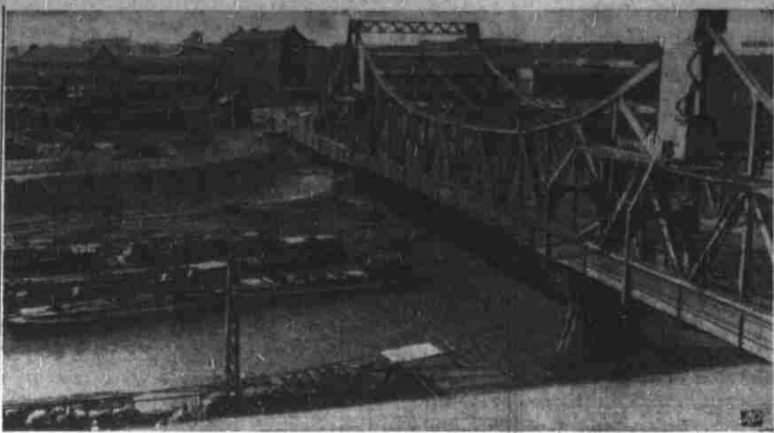
AT WAR'S BREEDING PLACE —Sere in this view of the much-discussed international bridge connecting the French concession at Tientsin, China, with Japanese part of city (far end).