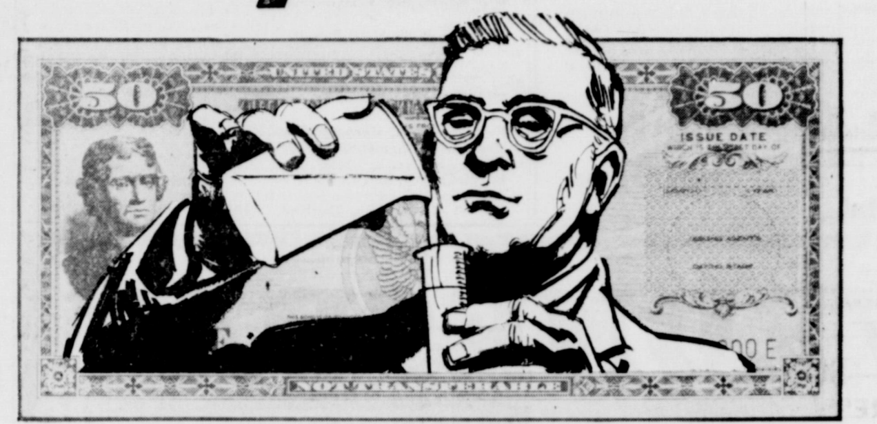
Money to let our scientists continue their search for answers. . . .