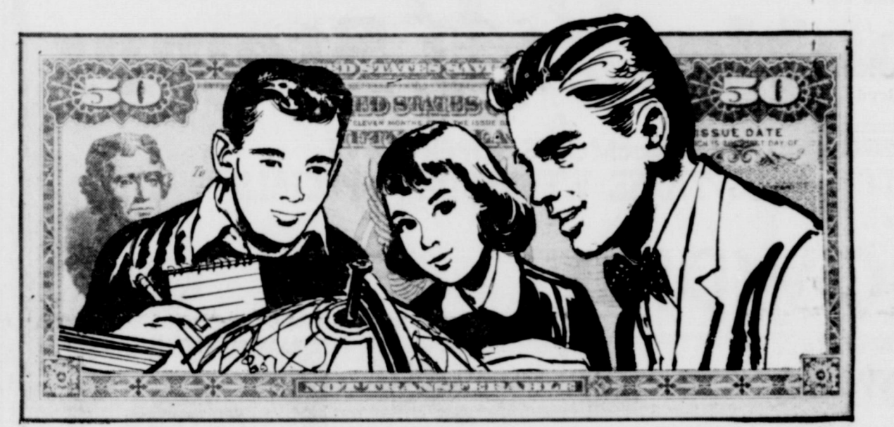
Money to help our children learn how to make peace lasting.

Yes; peace costs money. Money for research and schools and military preparedness. Money saved by individuals to keep our economy strong.