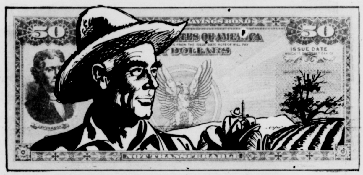
Money to insure that our productive power will thrive and grow....