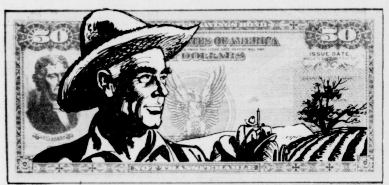
Money to insure that our productive power will thrive and grow....