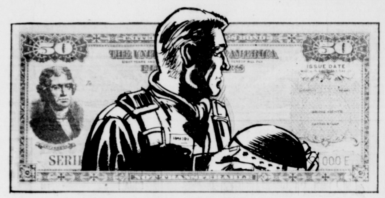
It takes money to keep our jet pilots up there patrolling the skies. . . .