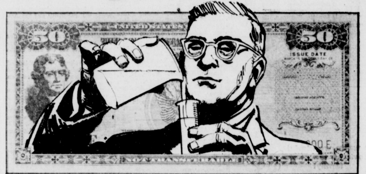
Money to let our scientists continue their search for answers. . . .