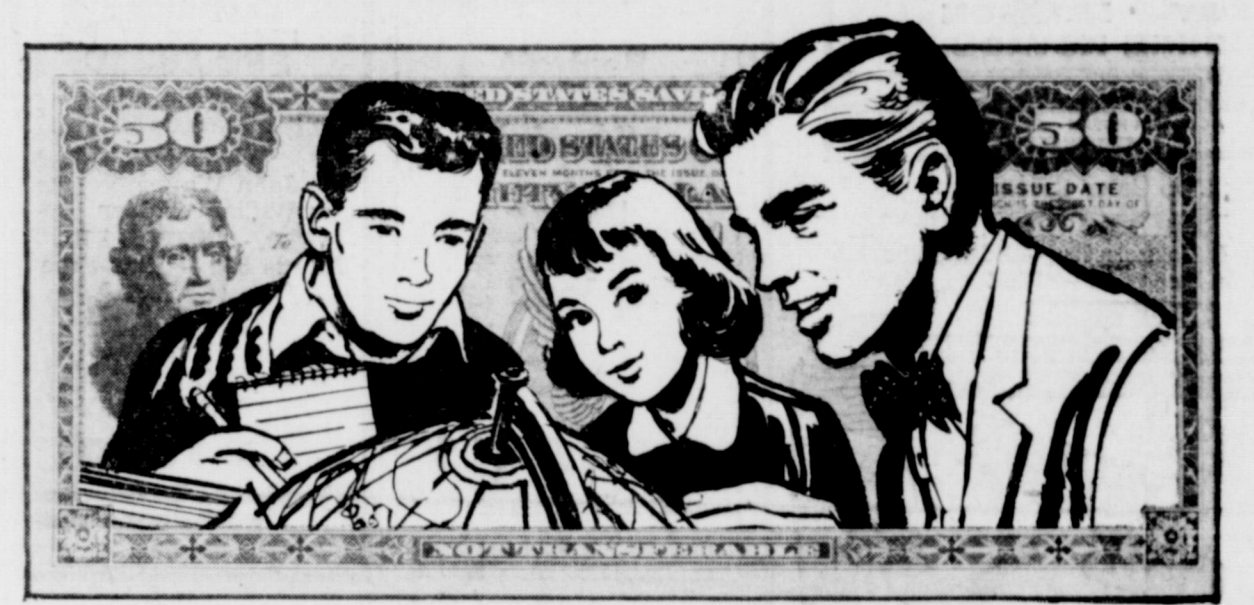
Money to help our children learn how to make peace lasting.

Yes; peace costs money. Money for research and schools and military preparedness. Money saved by individuals to keep our economy strong.